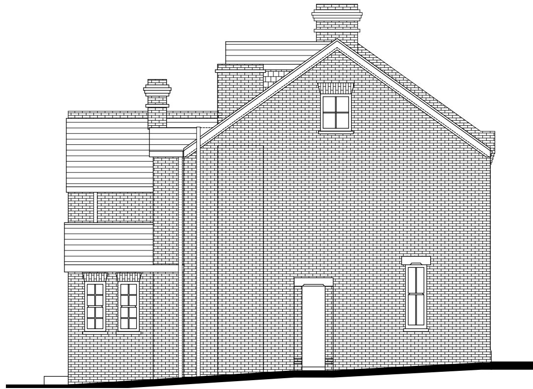
Existing Side Elevation Scale 1:100