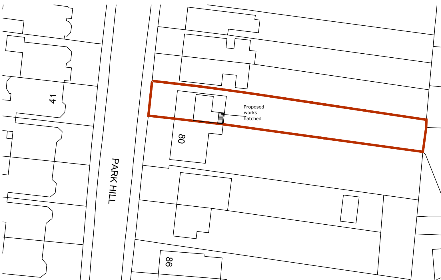
Proposed Block Plan Scale 1:500