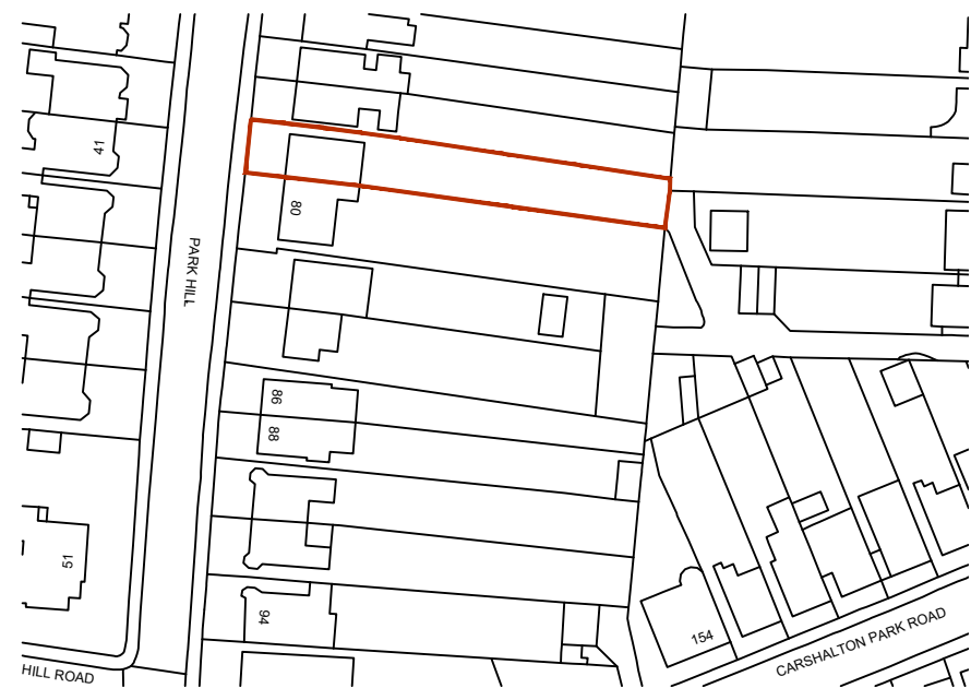
Existing Site Plan Scale 1:1250 Crown Copyright 2019 License No. 100022432