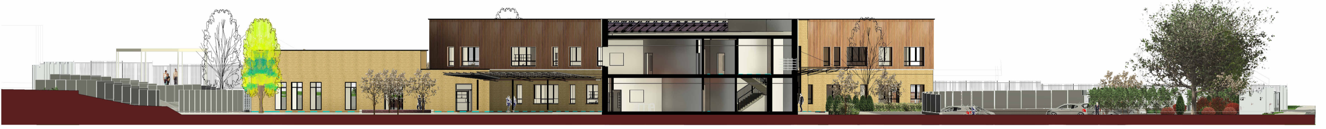
1 Site Section 1-1