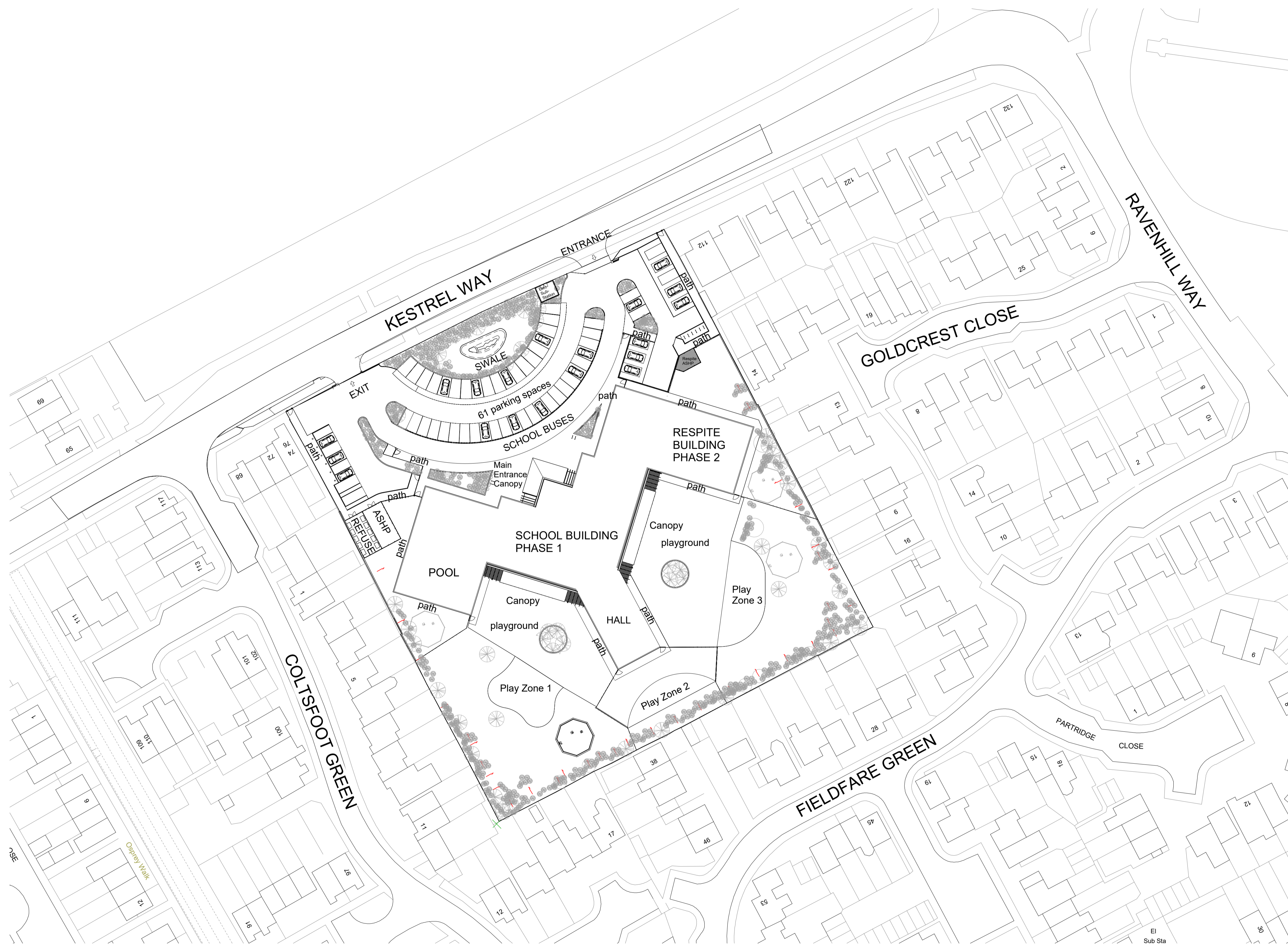
1 GA Site Block Plan 1 : 500

P0 Issued for Planning Approval Ska 21/12/23