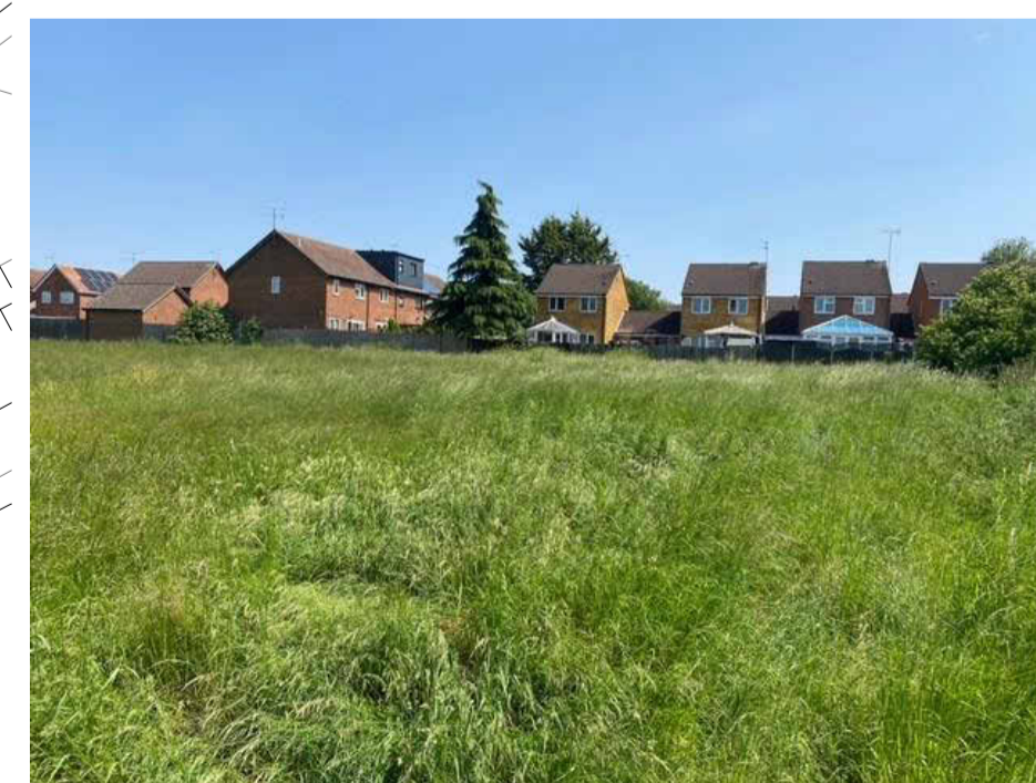
06 - VIEW LOOKING TO REAR OF SITE