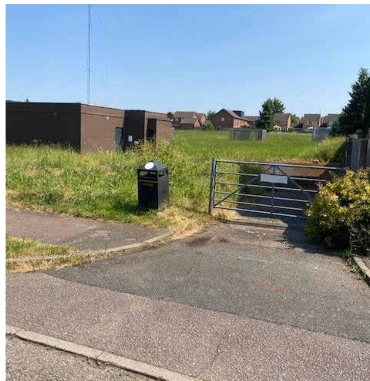
08 - VIEW LOOKING FROM EXISTING GATE TOWARDS EXISTING SUBSTATION