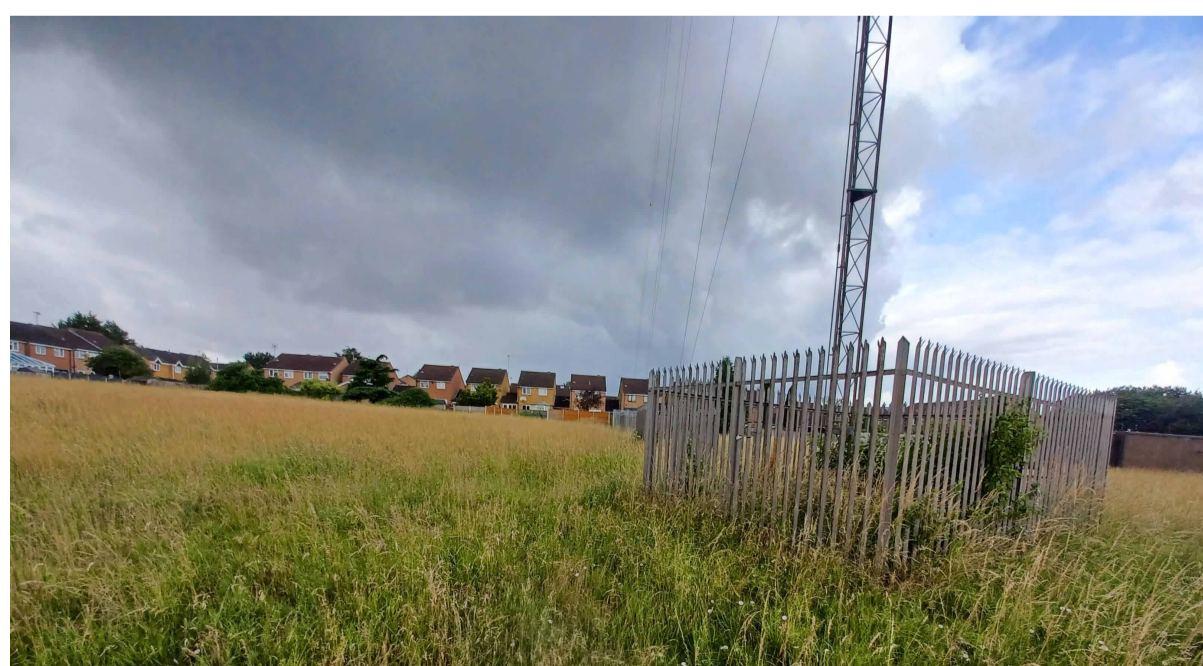
07 - VIEW LOOKING FROM REAR OF SITE TO LEFT OF EXISTING SUBSTATION