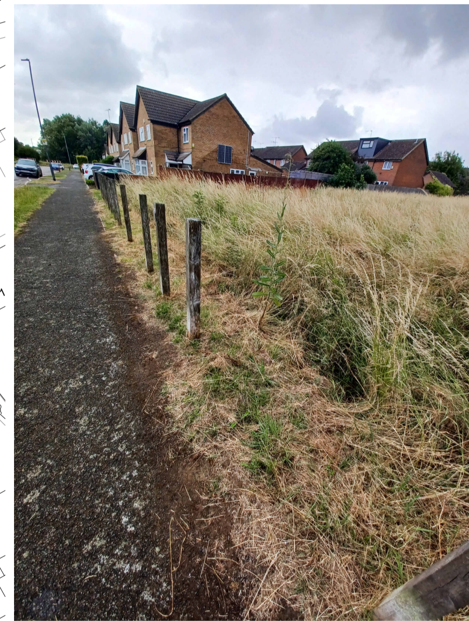
05 - VIEW LOOKING ALONG PEDESTRIAN PATH