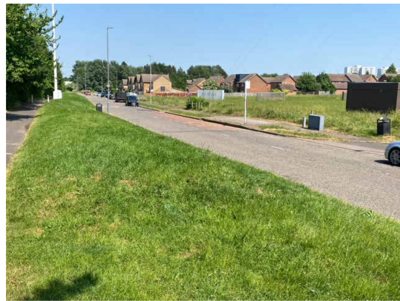
01 - VIEW LOOKING TO BUS STOP AND BEYOND