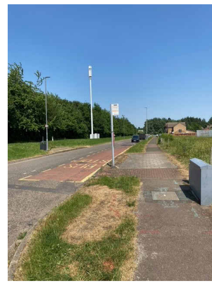
04 - VIEW LOOKING ALONG ROAD AT BUS STOP

Disclaimer This drawing is not to be scaled. Use Figured dimensions only. All dimensions to be checked on site, report any discrepancies to Property & Construction- Luton Borough Council. All drawings to be read in conjunction with specifications and relevant consultant information where applicable. © Luton Borough Council © Crown copyright and database rights 2017 Ordnance Survey 100023935