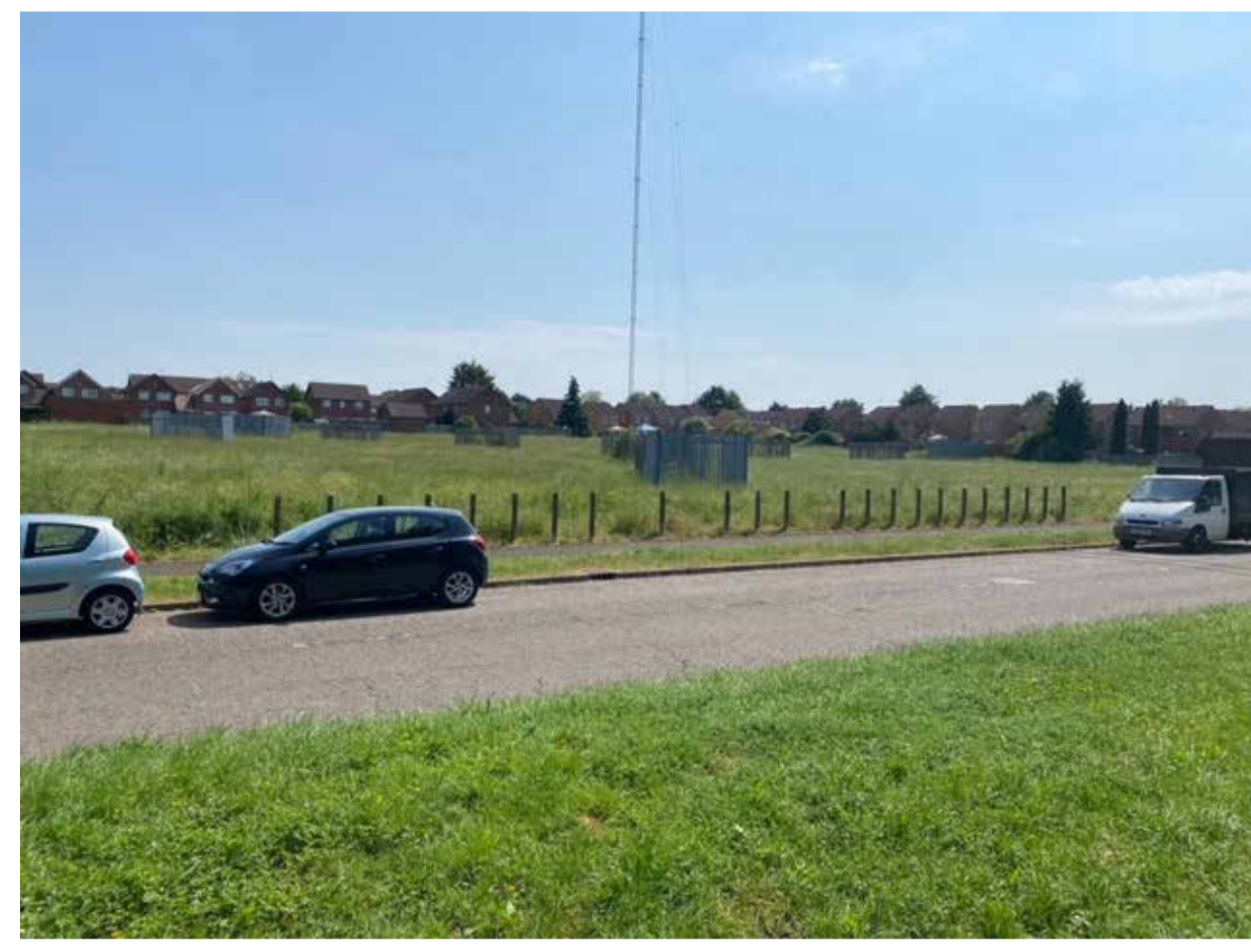
02 - VIEW LOOKING TO MIDDLE OF SITE AND BEYOND