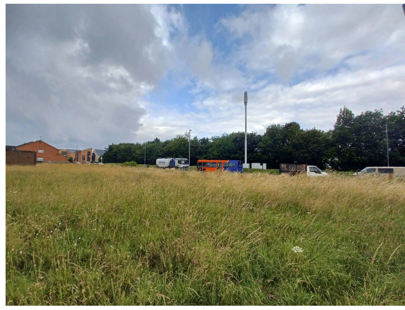
03 - VIEW LOOKING FROM SITE TO BUS STOP AND BEYOND