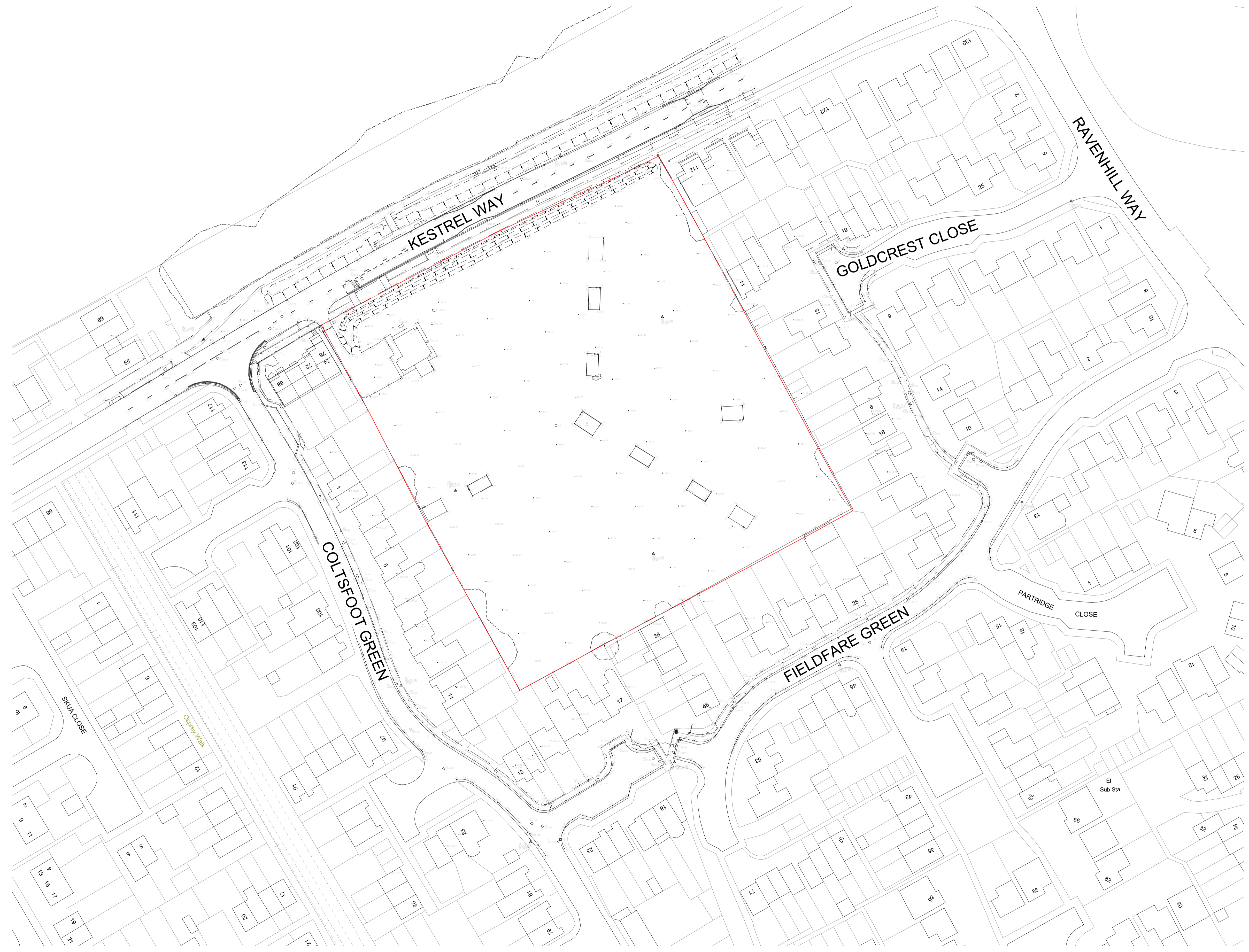
1 Existing Site Plan 1 : 500

E2225-DD-SI-XX-DR-A-SI 002 STAT REV S8 PD