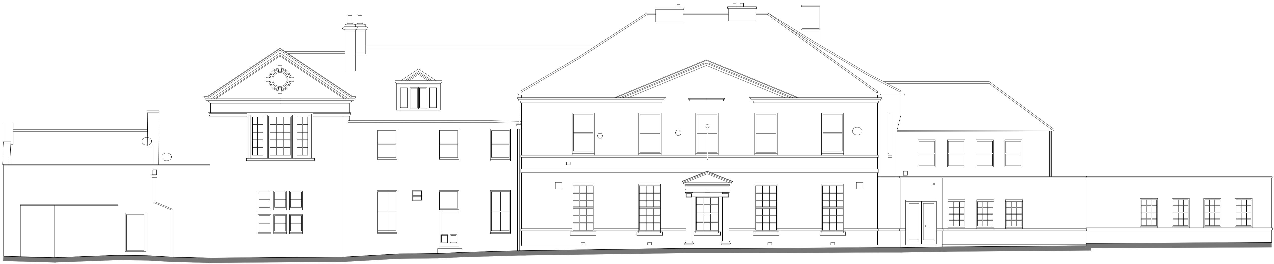
EXISTING ELEVATION FACING SOUTH