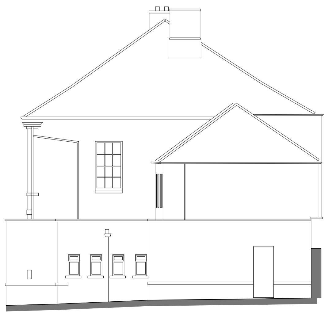
EXISTING ELEVATION FACING EAST