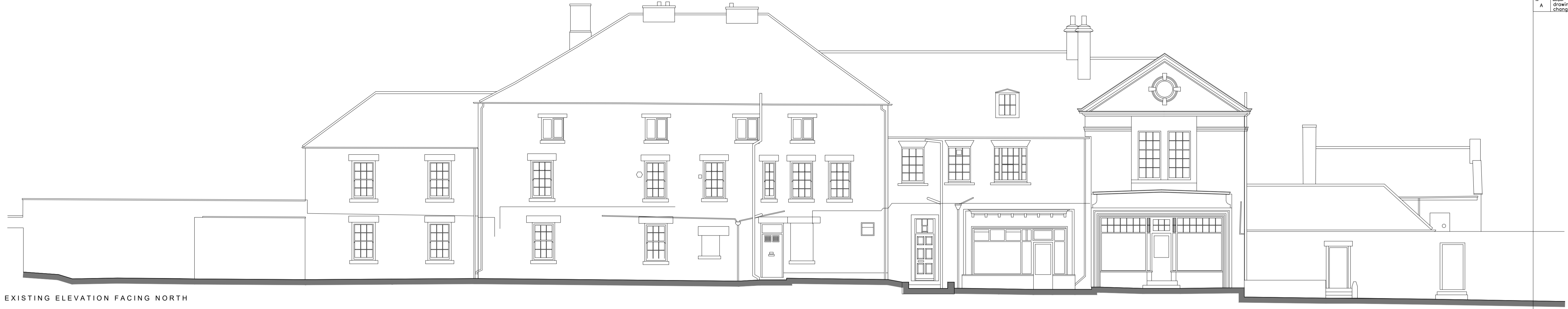
EXISTING ELEVATION FACING NORTH