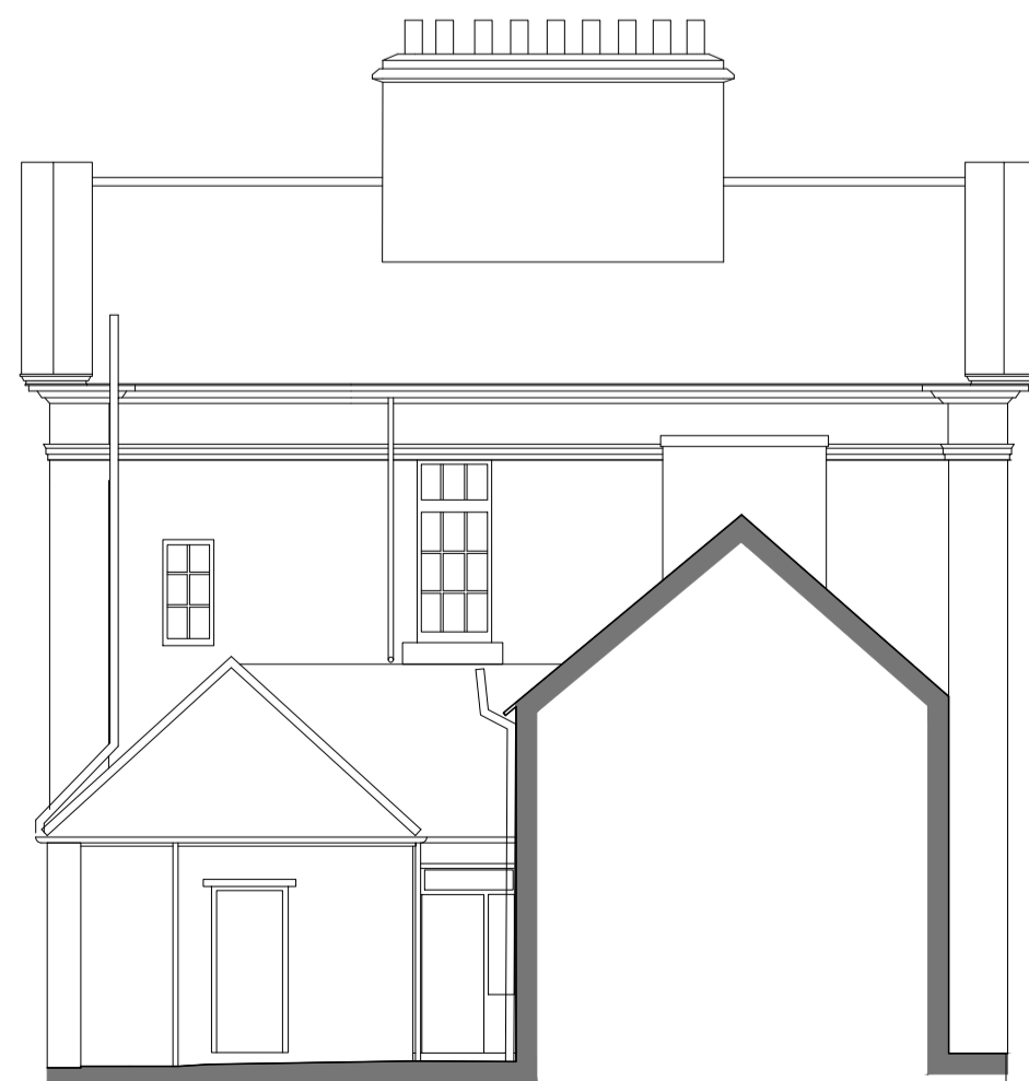
PROPOSED ELEVATION FACING WEST