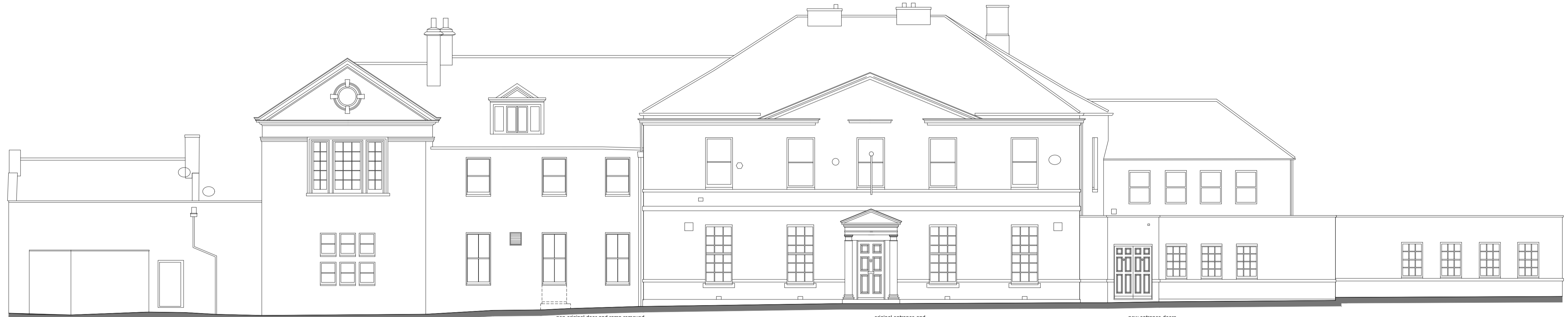
PROPOSED ELEVATION FACING SOUTH

non original door and ramp removed new window to match existing, adjacent added new stonework infill and sill to match existing frame profiles, painting and details of window to match existing retained windows to either side original entrance and door re-instated door to be painted hardwood in a painted hardwood frame paneled and fielded as shown with polished brass knocker and letter box new entrance doors to replace existing