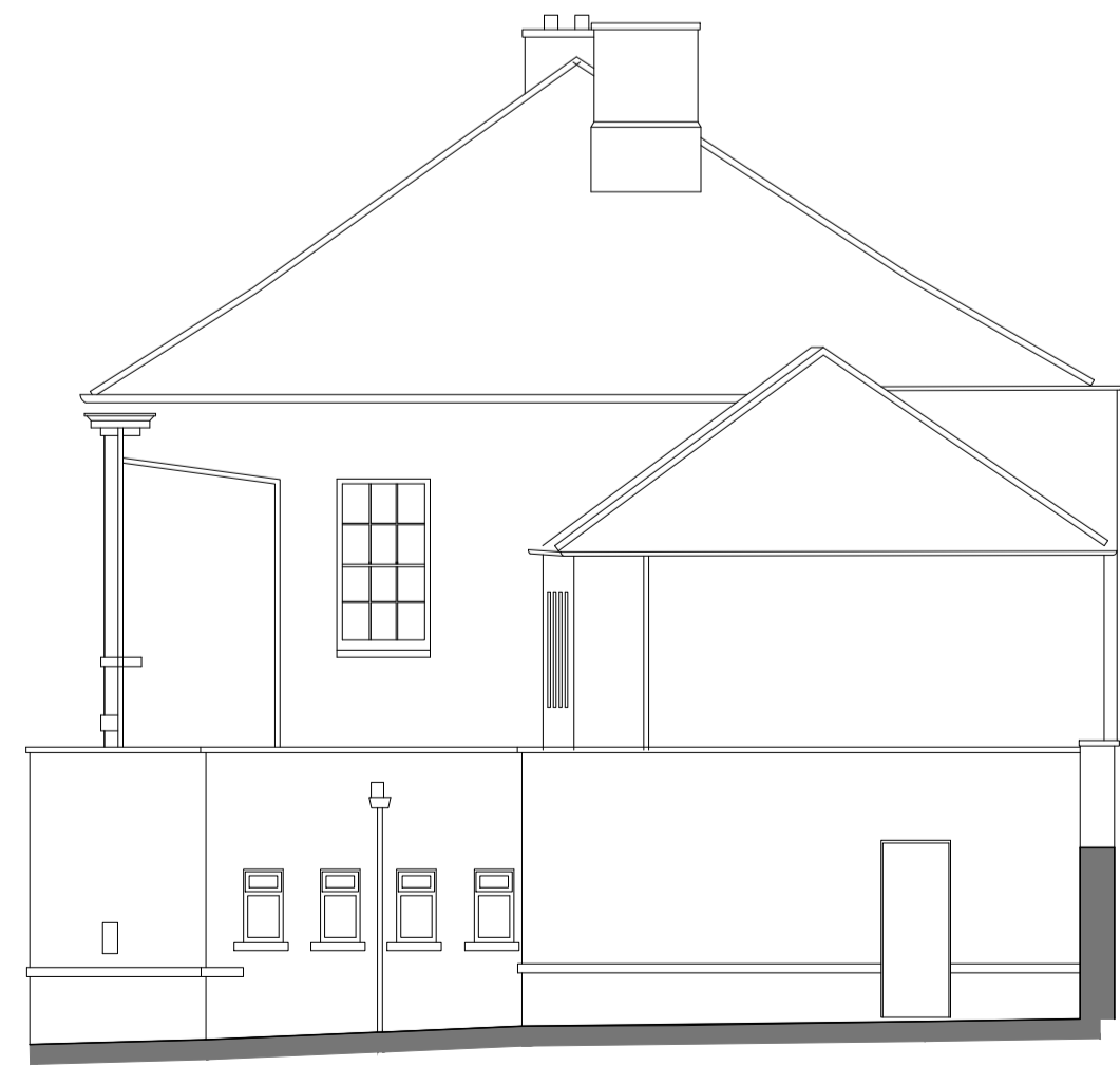
PROPOSED ELEVATION FACING EAST

non original door and ramp removed new window to match existing, adjacent added new stonework infill and sill to match existing frame profiles, painting and details of window to match existing retained windows to either side original entrance and door re-instated door to be painted hardwood in a painted hardwood frame paneled and fielded as shown with polished brass knocker and letter box new entrance doors to replace existing