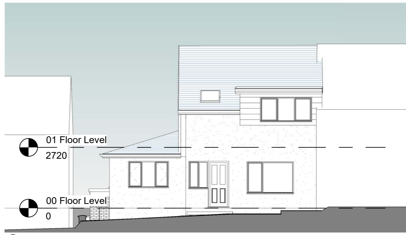
3 Existing Front Elevation 1 : 100