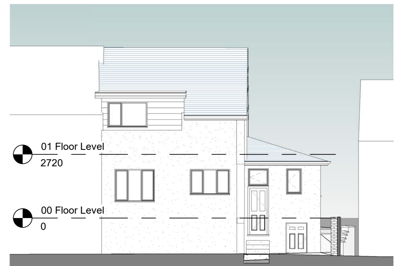
5 Existing Rear Elevation 1 : 100