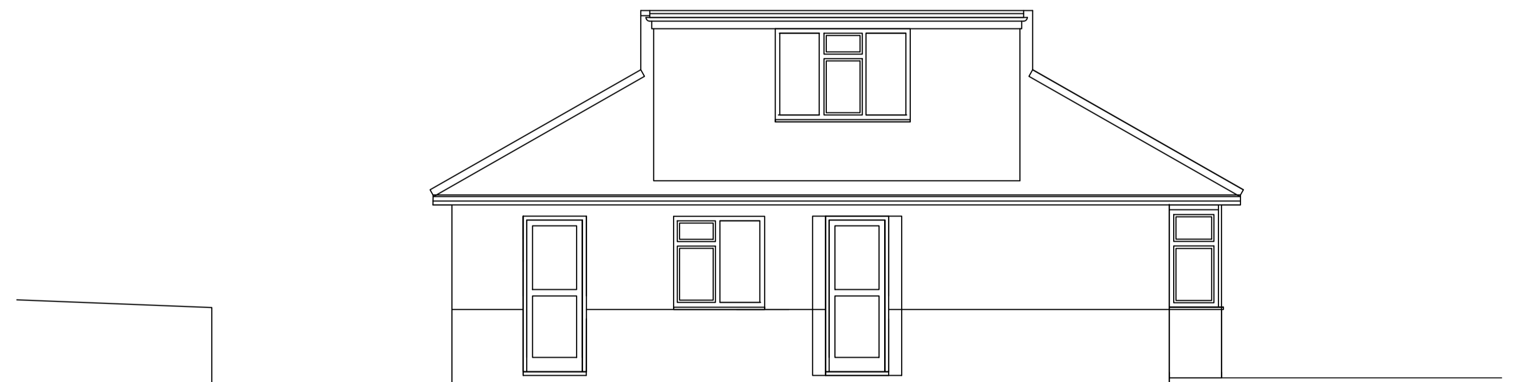
EXISTING SIDE ELEVATION Scale 1:50