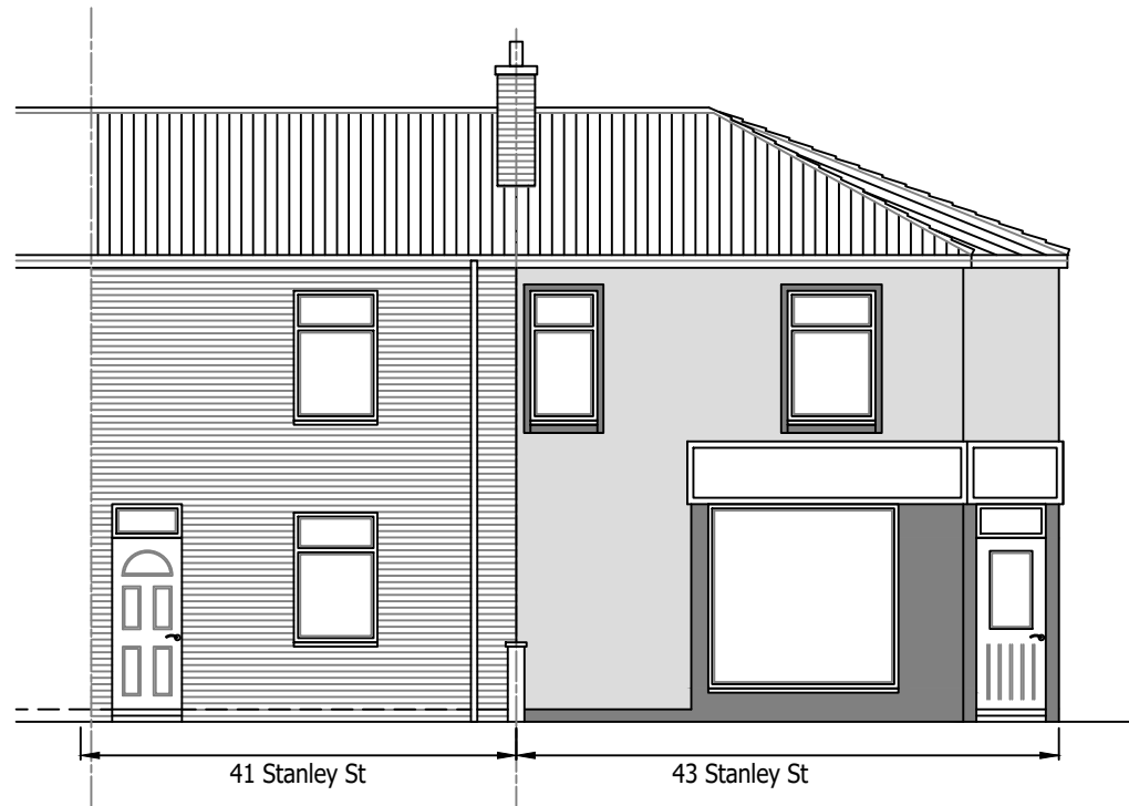
EXISTING ELEVATION FROM STANLEY STREET Scale 1:100