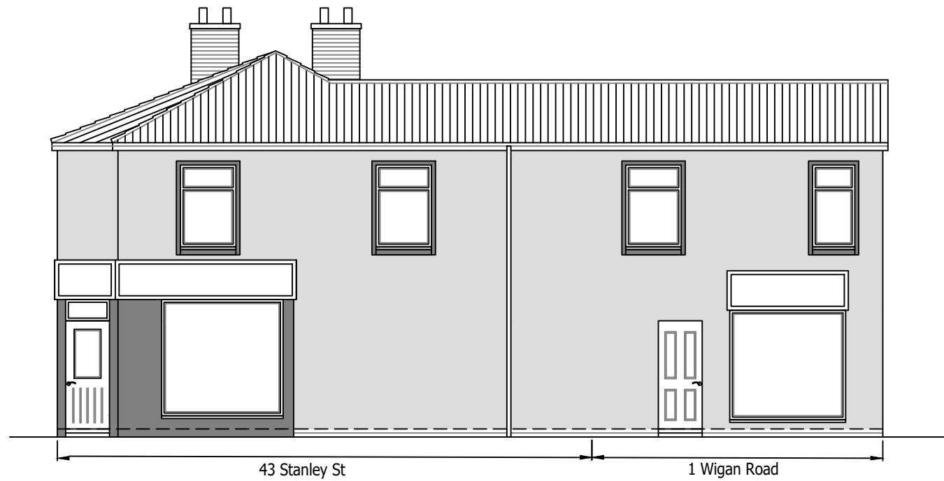
EXISTING ELEVATION FROM WIGAN ROAD Scale 1:100