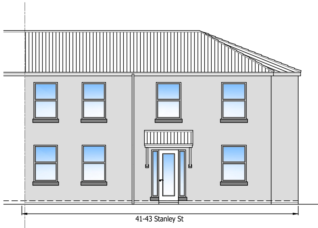
PROPOSED ELEVATION FROM STANLEY STREET Scale 1:100