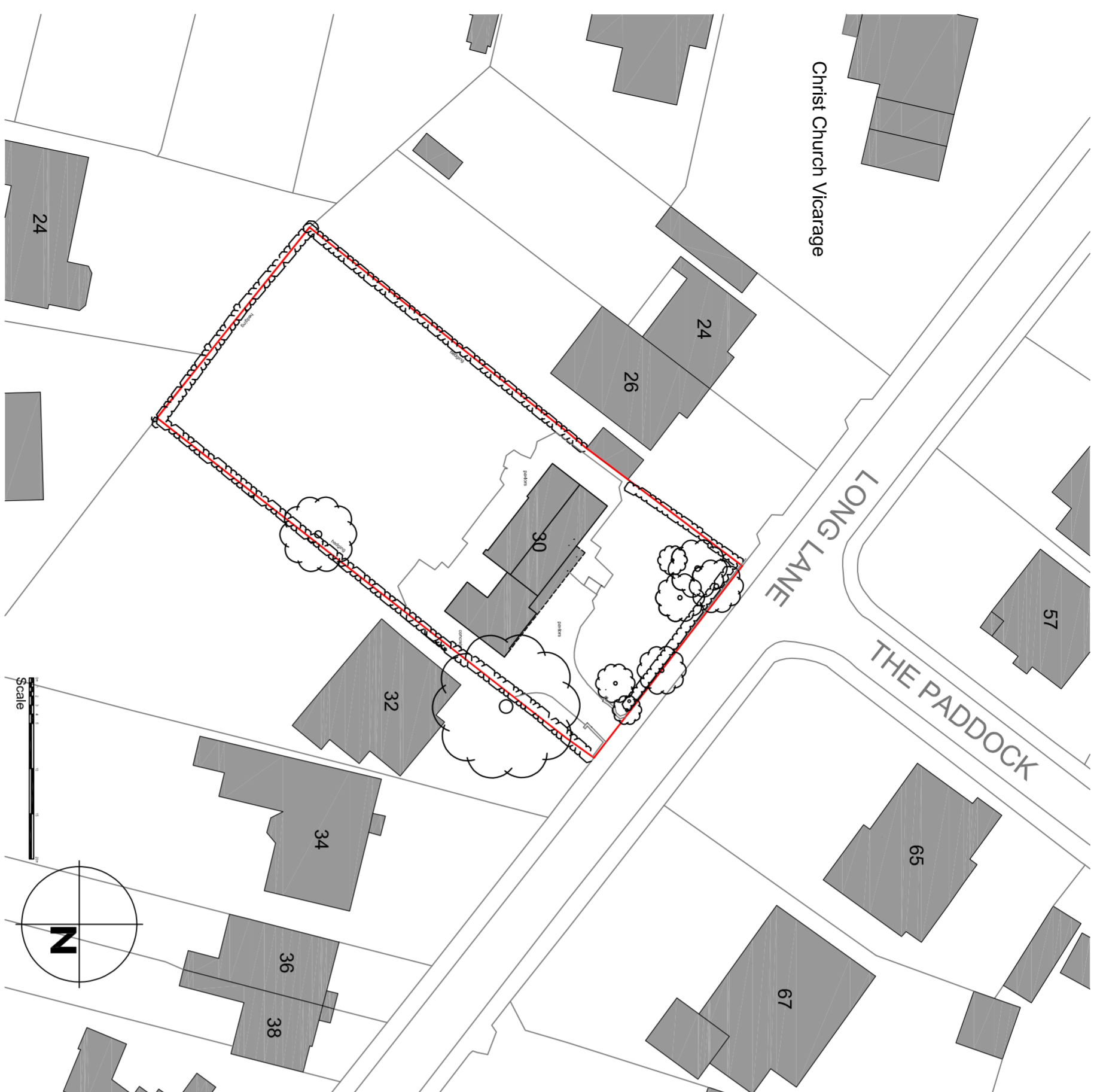
Existing Site Block Plan 1:200