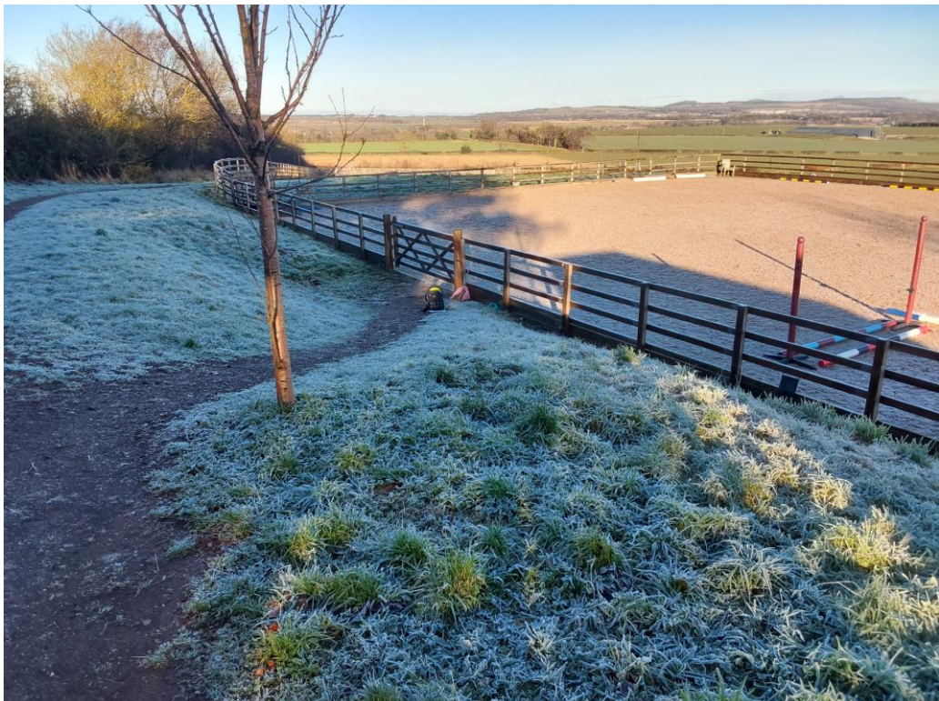
2. Path to riding arena gate