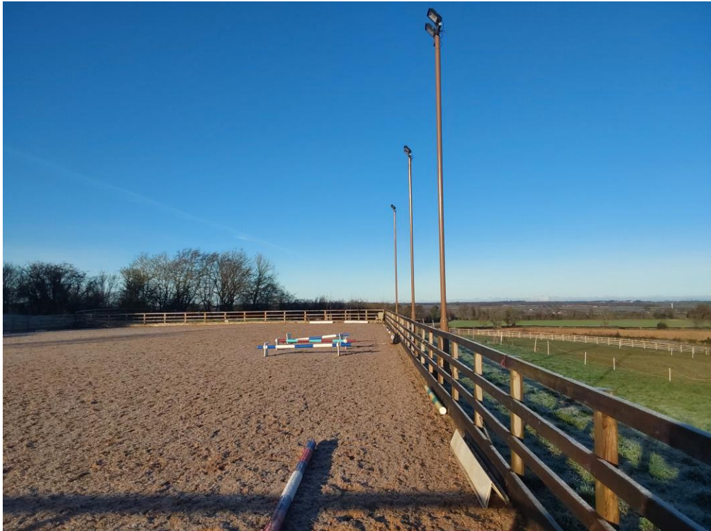
3. External lighting to east edge of arena, providing downlighting to surface