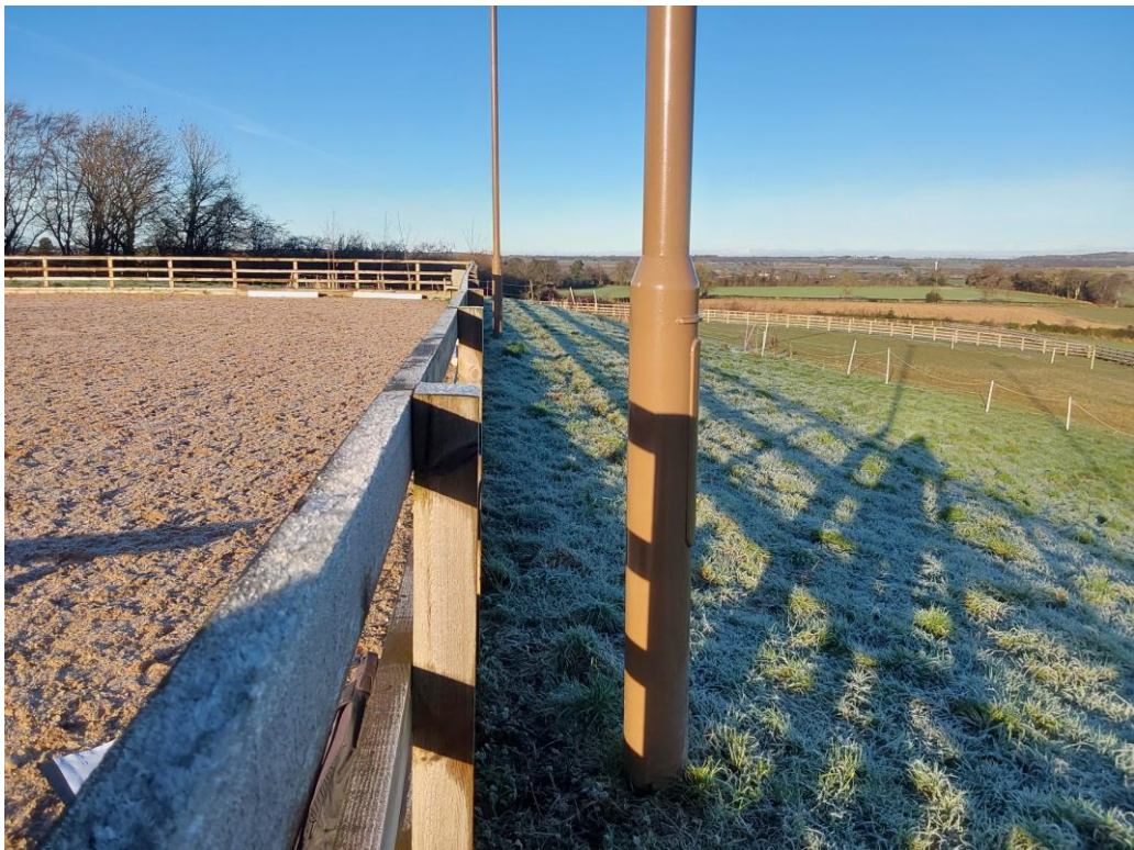
4. Light brown painted finish to light poles