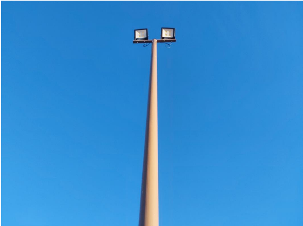
5. Aluminium light poles 8m height