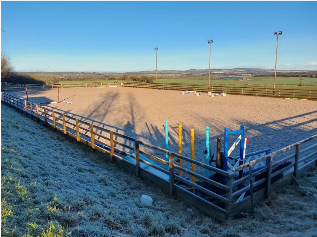
1. View of riding arena facing north