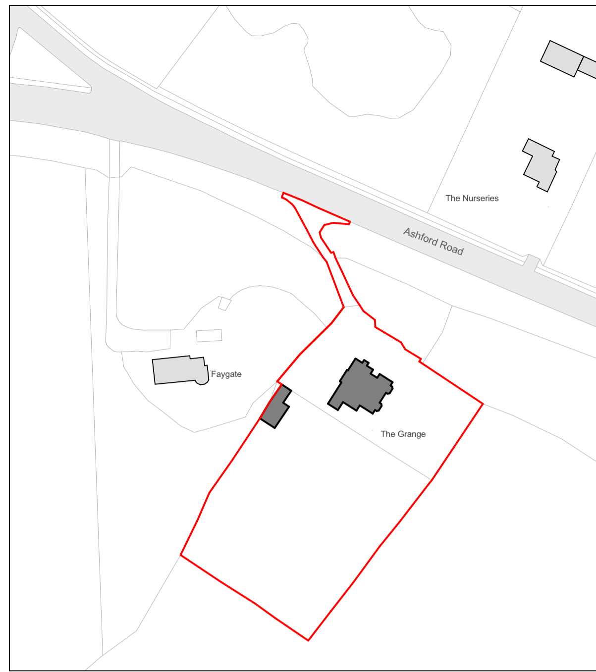
2011 Location Plan 1:1250