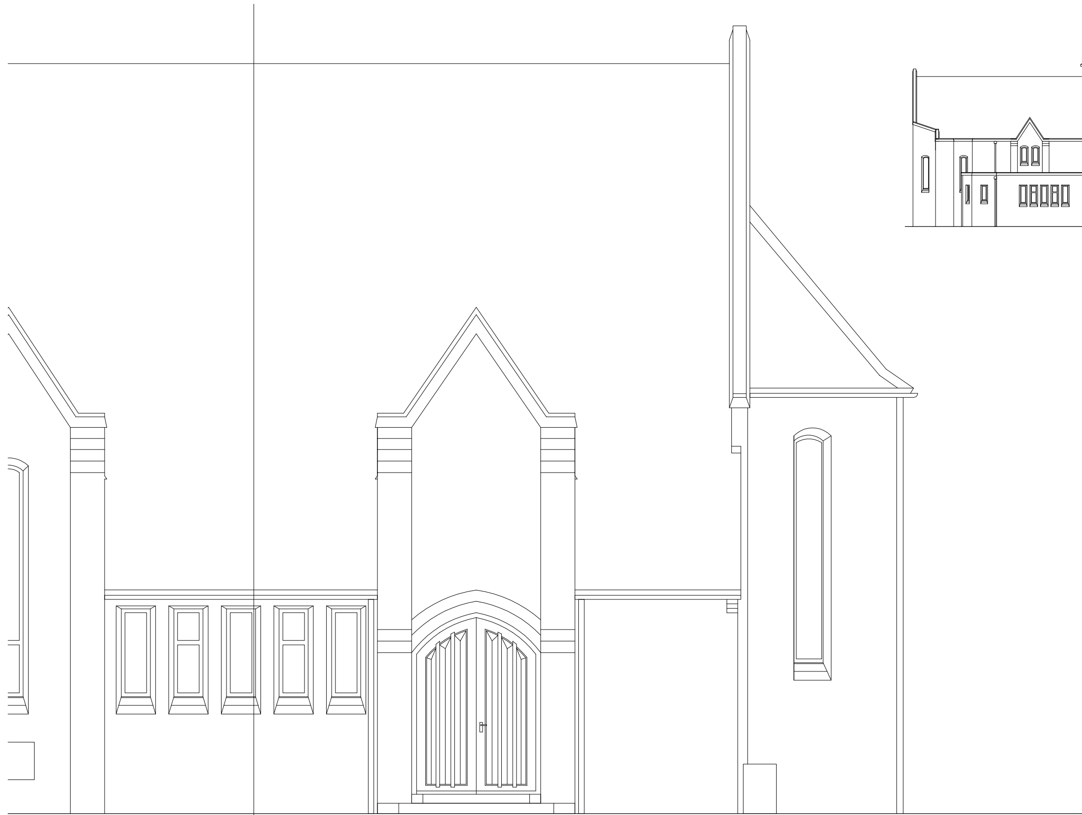
North Elevation as existing Scale 1:50 @ A3