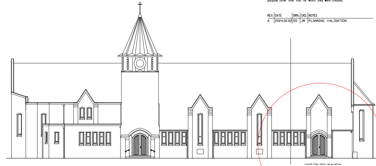
Key elevation Not to scale