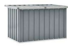
Keketa Large Garden Storage Box, Metal Deck Box, Outdoor Storage Shed, Garden Tool ... 6 £117.56