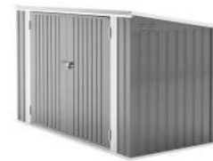
XEMQENER Lockable Garden Storage Shed, Outdoor Bike Shed with Door and Roof, Metal ... 18 £210.99