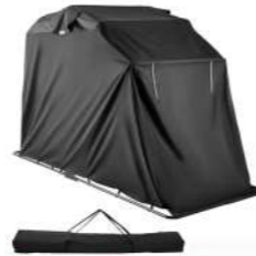
Mophorn Motorcycle Tent Motorbike Cover Strong Frame Motorbike Garage Waterproof 10... 18 £105.99