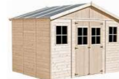
Wooden Garden Shed - Apex Shiplap Wooden Shed with Windows 14x7 ft/8m2... 73 £1,597.00 Climate Pledge Friendly