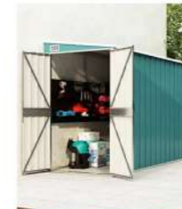
Gecheer Garden Shed Tool Shed Wall-moun Garden Storage Shed Garden House Outdo £296.55