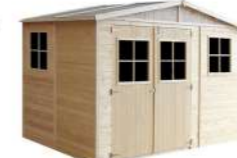
Wooden Garden Shed, 17 mm planks - Sheds and Outdoor Storage - Wooden Shed with Win... 59 £1,022.00 Climate Pledge Friendly