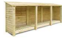
Rutland County Garden Furniture Empingham 4ft Tall Log Store/Garden Storage... 35 £414.99