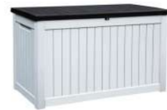
YITAHOME 870 L Garden Storage Box Large, Waterproof Outdoor Storage Box Lockable... £289.99