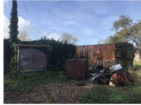
C(i,ii,&iii) - Sheds