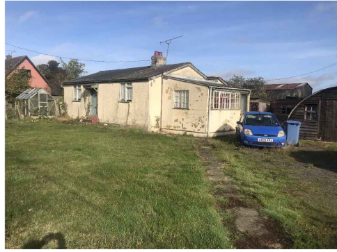
A - Bungalow