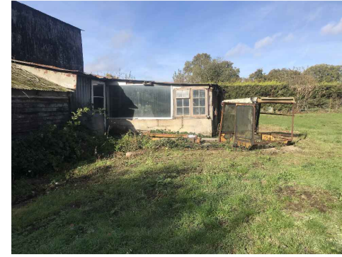
E - Barn 3