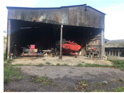
D - Barn 1