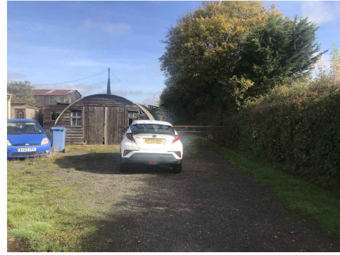
B - Store 1