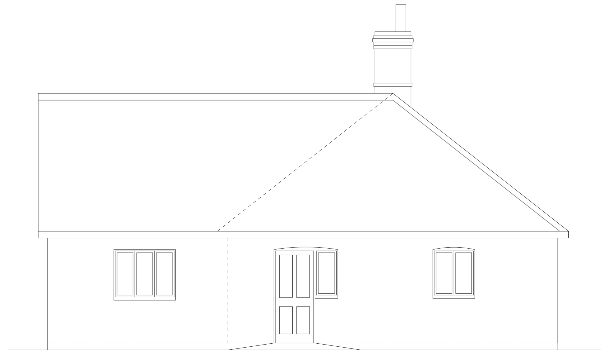
SIDE - SOUTH EAST ELEVATION