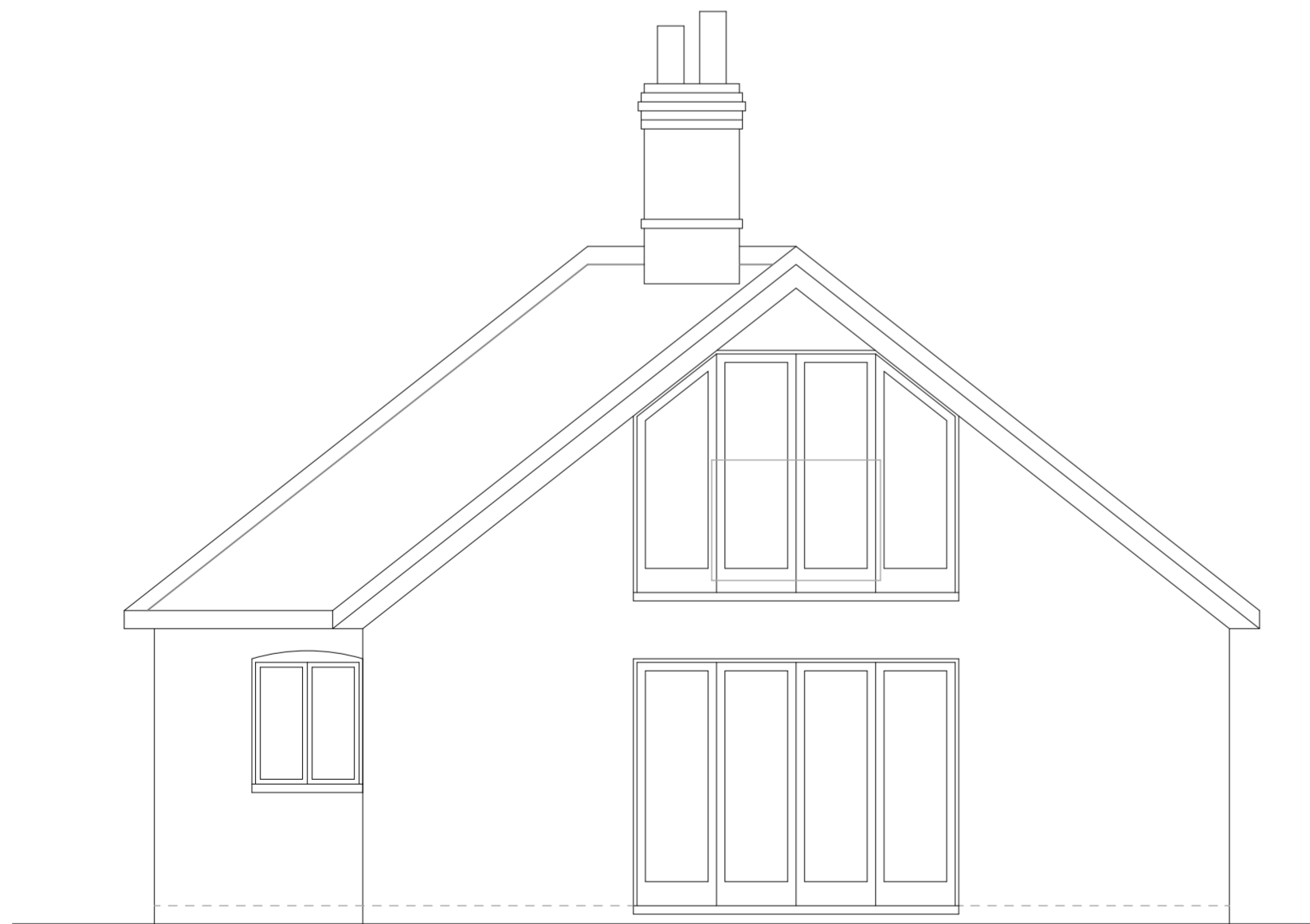
BACK - SOUTH WEST ELEVATION