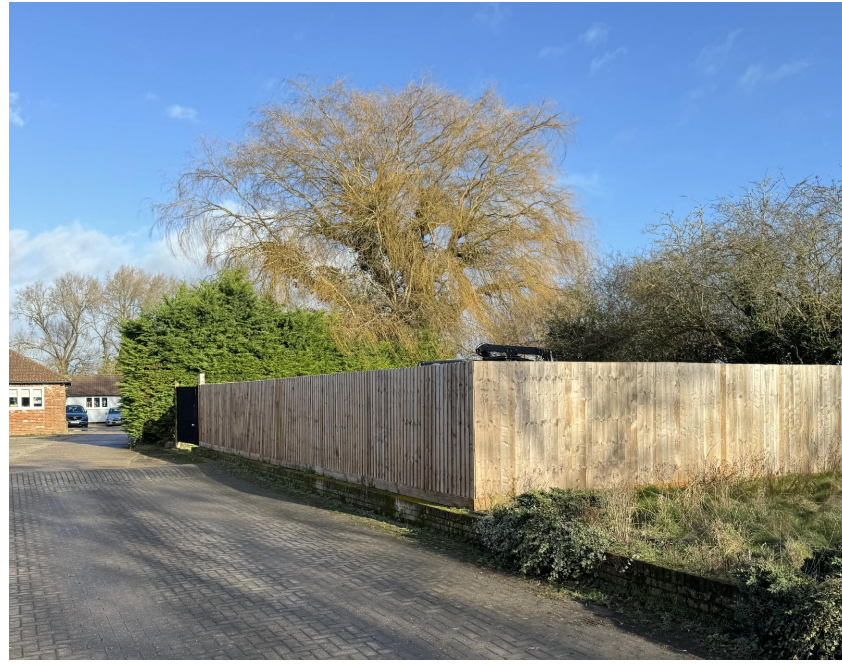
Fence and Gate Details - View 01 (V1)