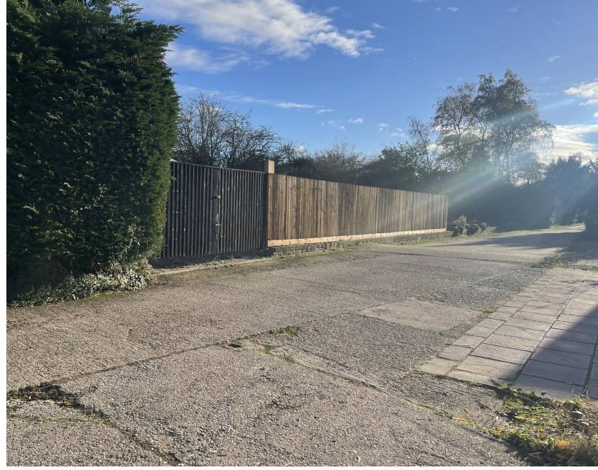
Fence and Gate Details - View 02 (V2)