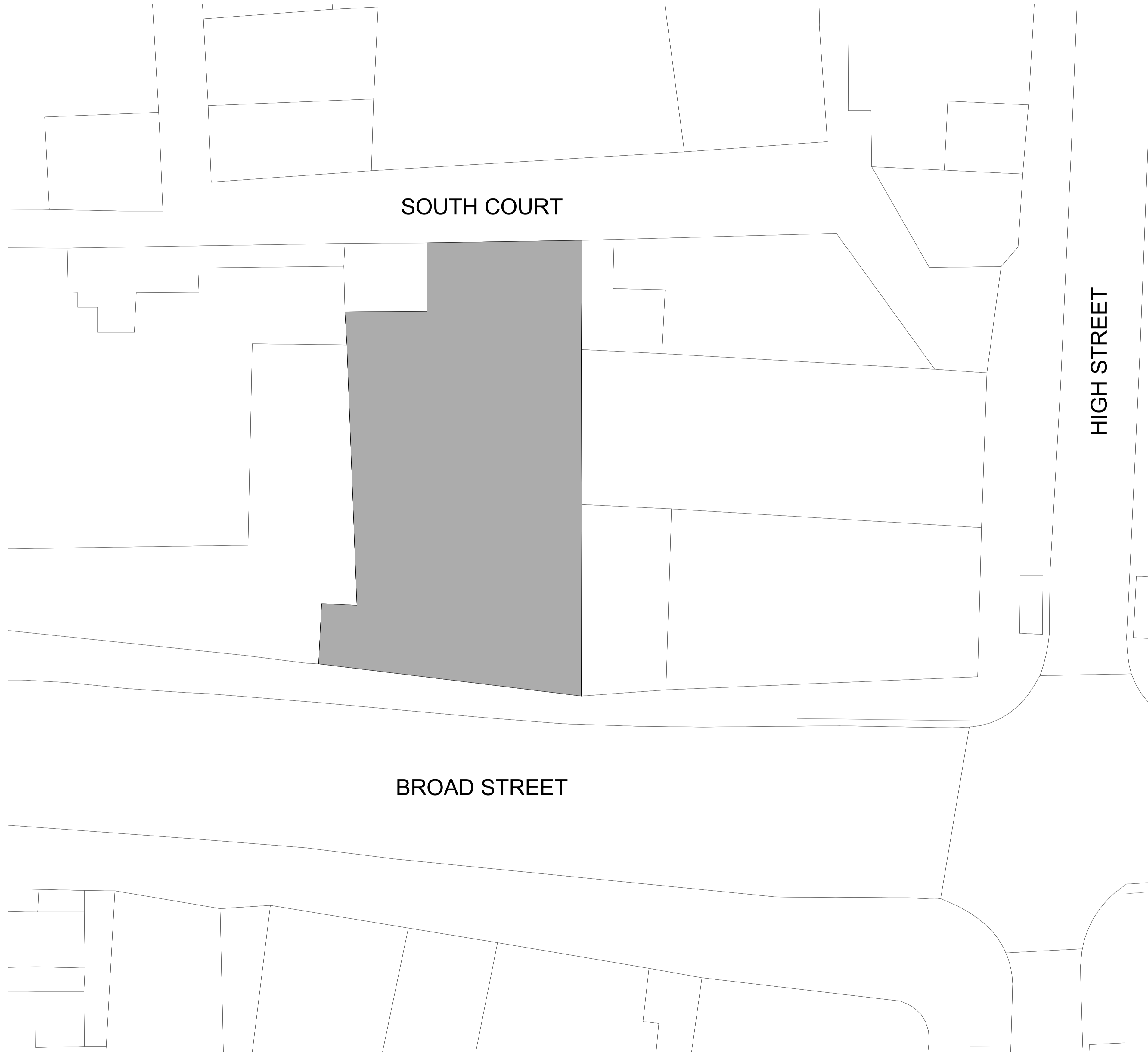
Proposed Block Plan 1:100

NOTES All dimensions to be verified on site, and the Architect informed of any discrepancy. All drawings and specifications should be read in conjunction with the Health and Safety Plan; all conflicts should be reported to the Principal Designer. This drawing is the copyright of C+A Design Limited. © DO NOT SCALE FROM THIS DRAWING