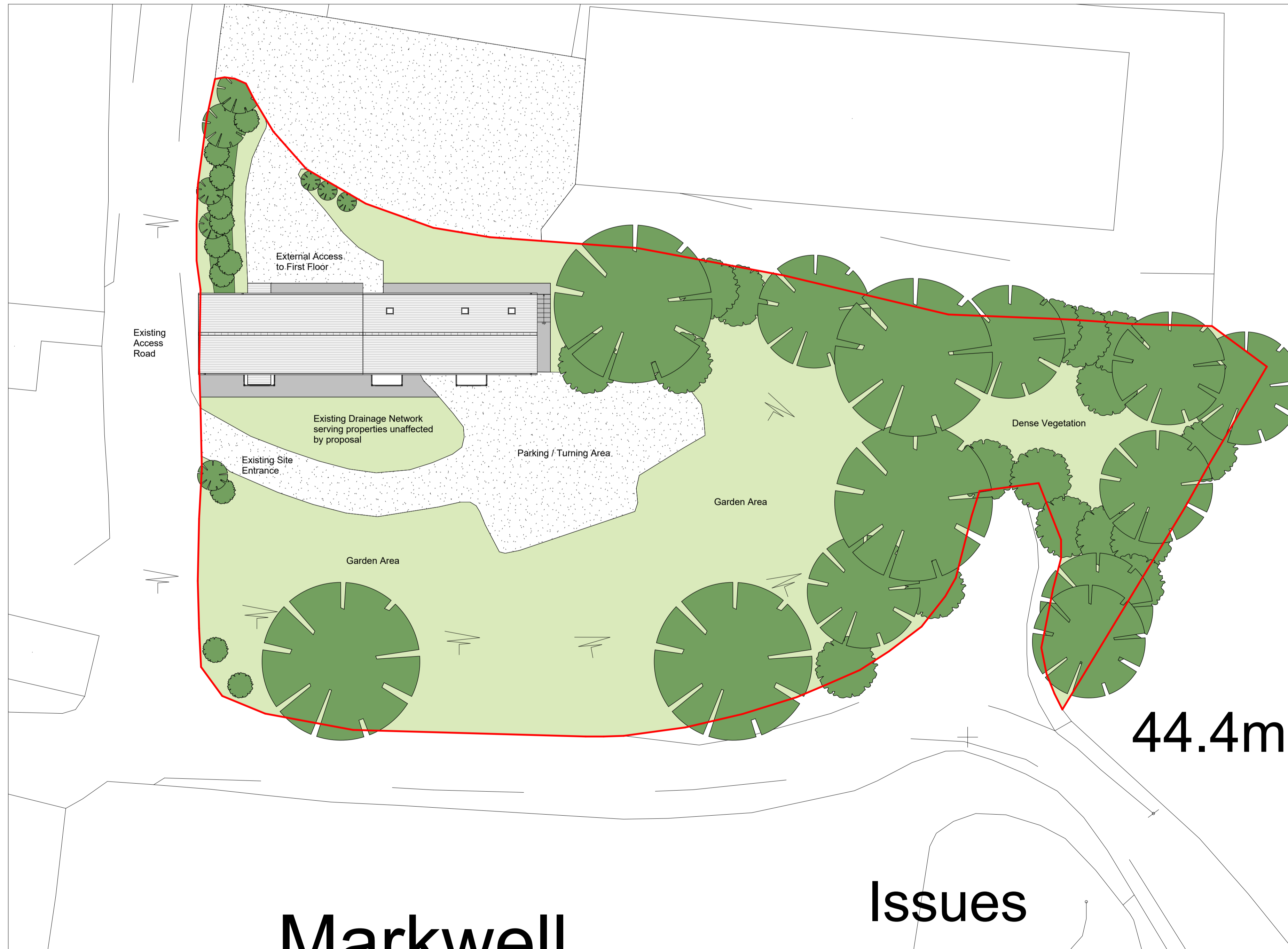
5 Proposed Site Plan 1 : 200