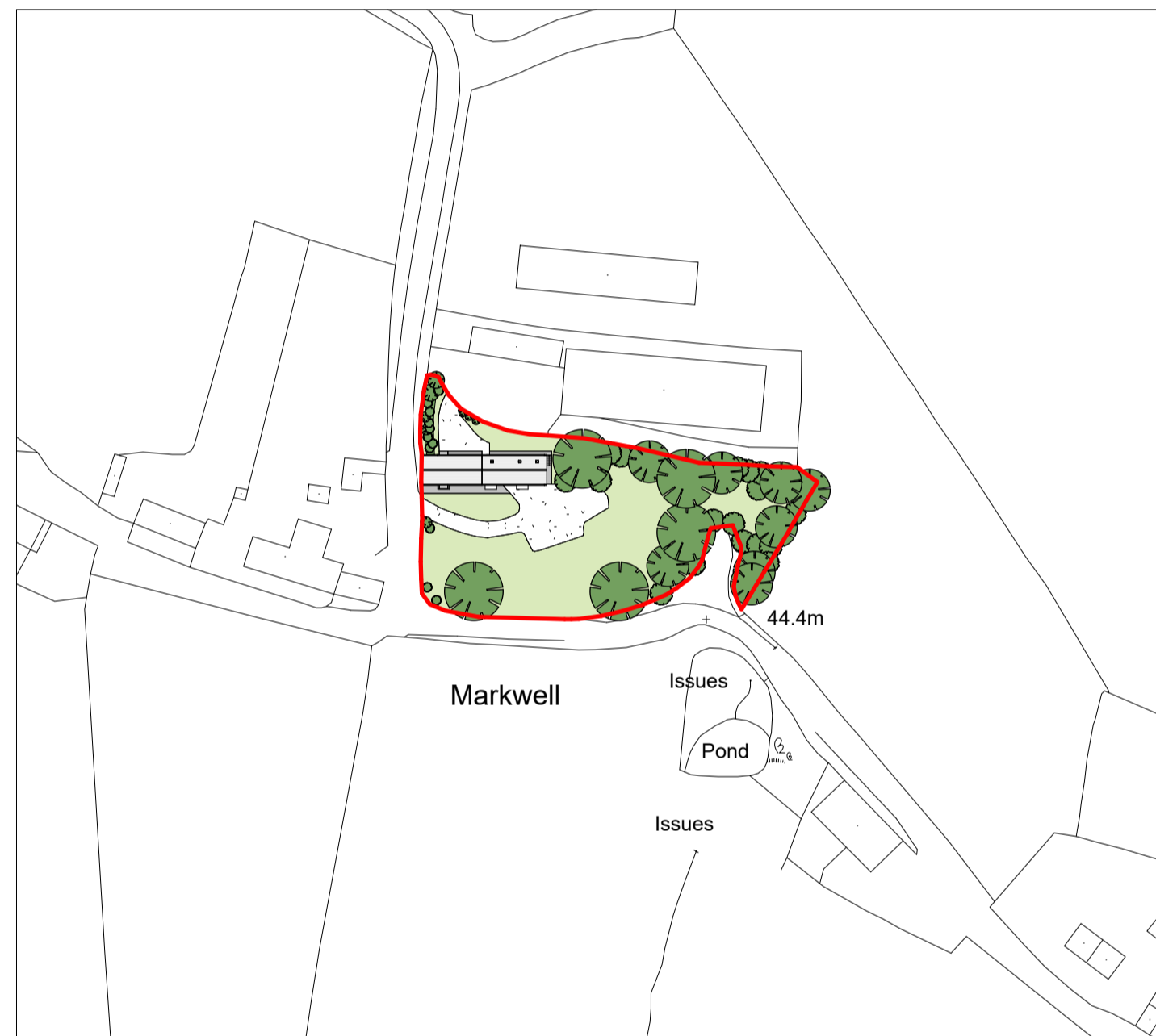
3 Proposed Location Plan 1 : 1250