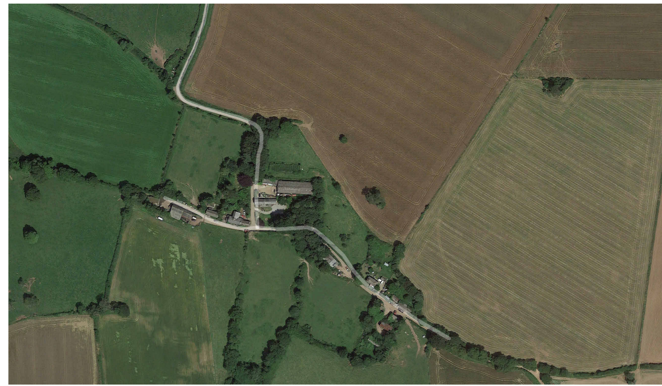
Google Earth Image