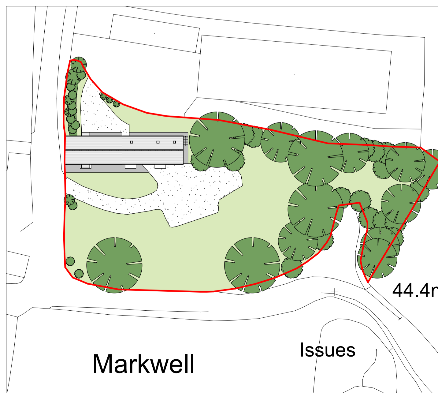
4 Proposed Block Plan 1 : 500

Project No. 2389 Drawing No. 001 Rev. PL1