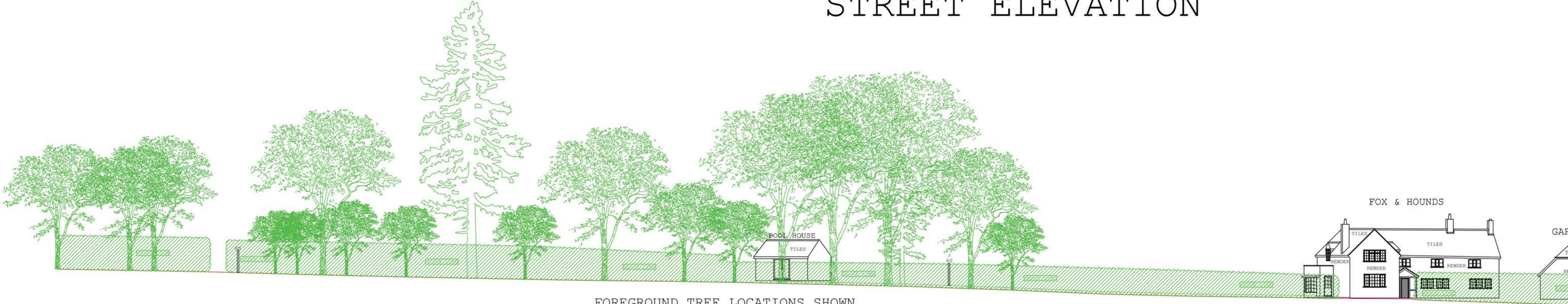
FOREGROUND TREE LOCATIONS SHOWN