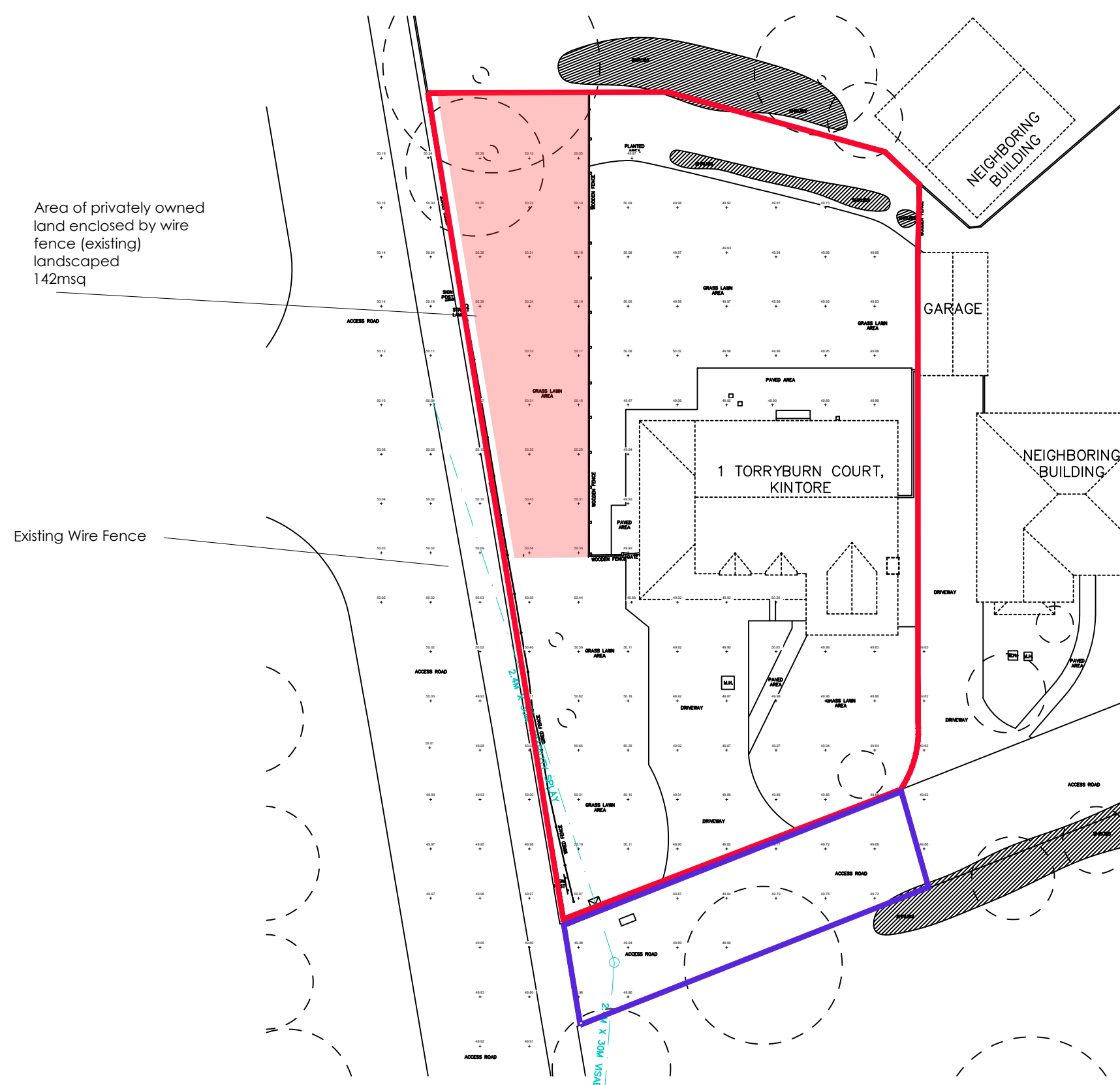
EXISTING SITE PLAN 1:250 @ A3