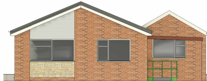
1 Proposed Front Elevation 1 : 100