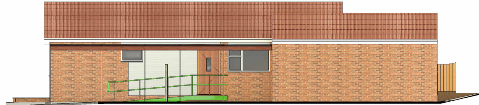
2 Proposed Side Elevation 1 : 100