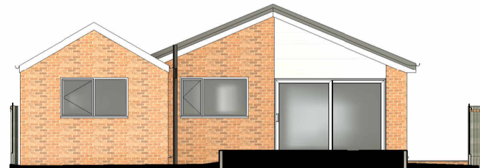
3 Proposed Rear Elevation 1 : 100