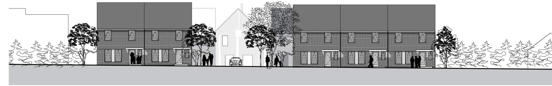
STREET ELEVATION A-A

Do not scale from this drawing. All dimensions to be checked on site prior to commencement of work. Check that this drawing is the latest revision, if in doubt ASK. This drawing is copyright, refer any discrepancy to GROW Design Studio Ltd. THIS PLAN HAS BEEN PREPARED FROM INFORMATION PROVIDED BY THE CLIENT AND FROM ORDNANCE SURVEY PLANS AND AS SUCH CANNOT BE RELIED UPON FOR ACCURACY OF SITE DIMENSIONS. The client is responsible for defining the correct boundaries and site ownership to GROW Design Studio Ltd. GROW Design Studio Ltd cannot be held responsible for subsequent land ownership disputes. © GROW Design Studio Ltd