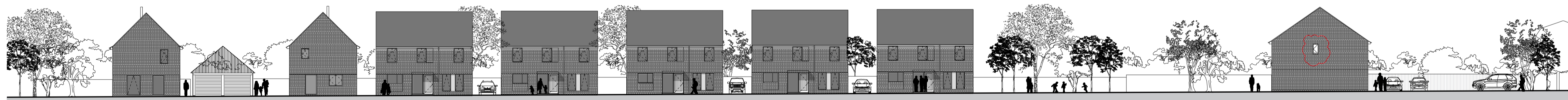
STREET ELEVATION C-C