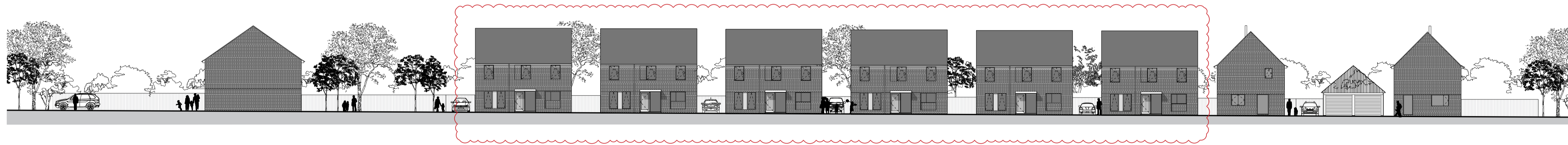
STREET ELEVATION B-B