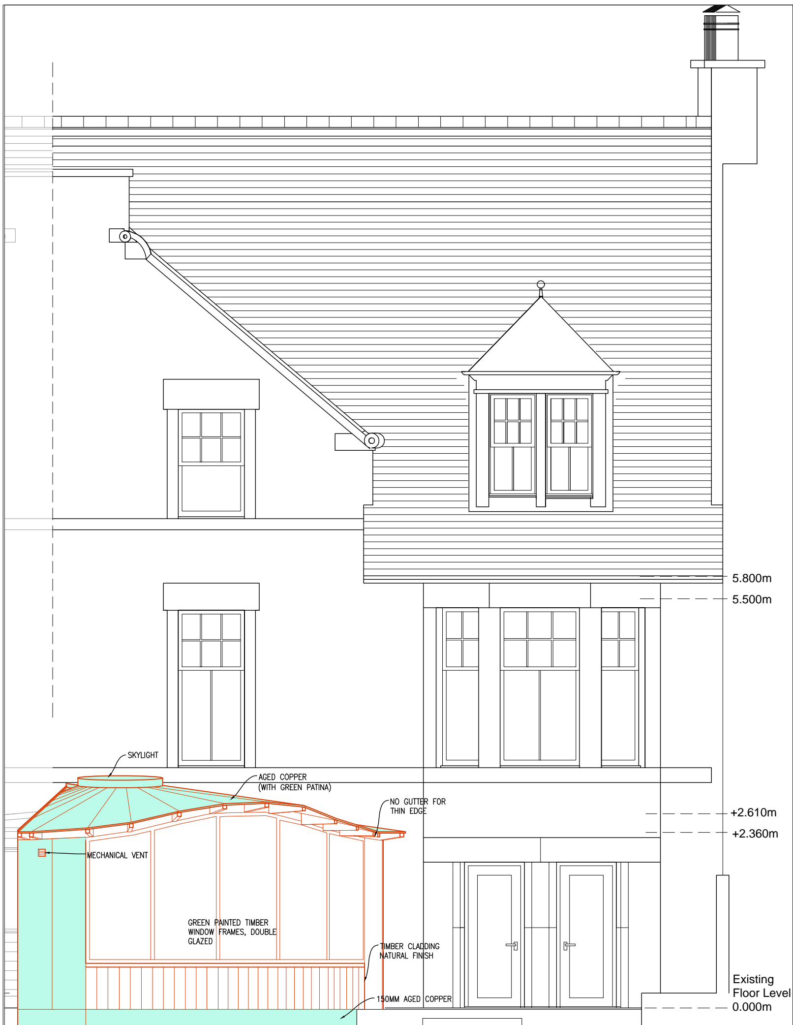
REAR ELEVATION - SCALE 1:50

17 VICTORIA TERRACE, EDINBURGH, EH1 2JL TEL: 0131 220 3366 info@BenjaminTindallArchitects.co.uk