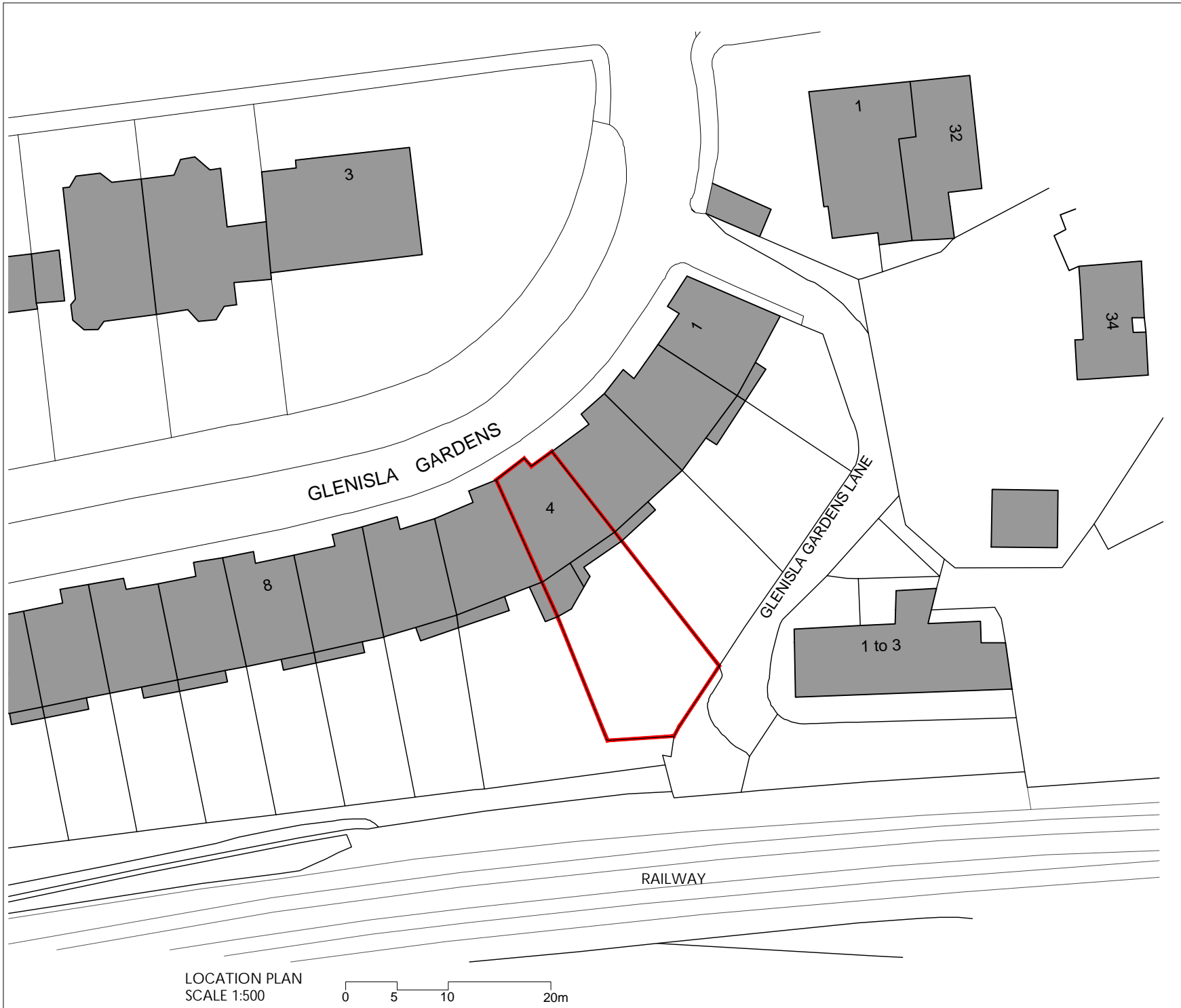
LOCATION PLAN SCALE 1:500