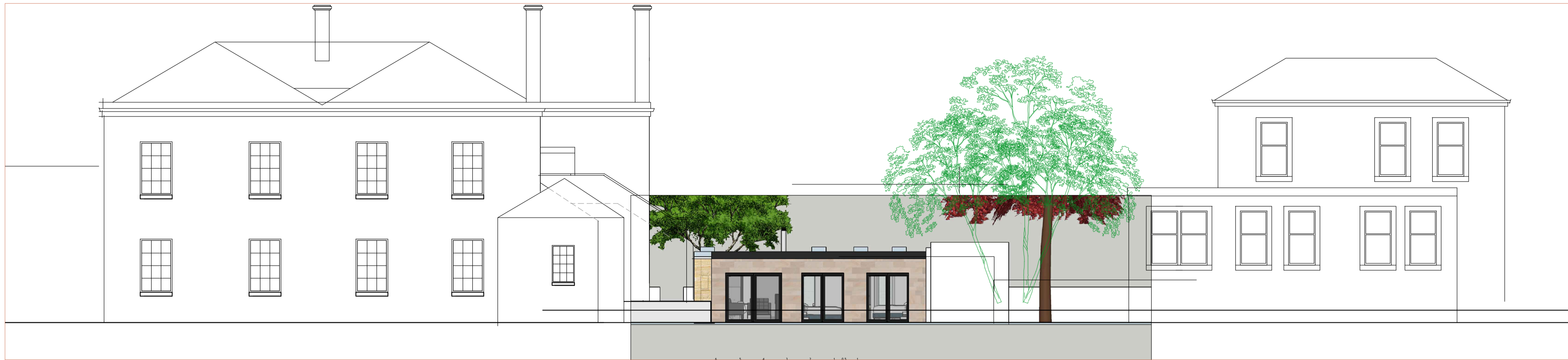
rear elevation north east 1 : 1 0 0