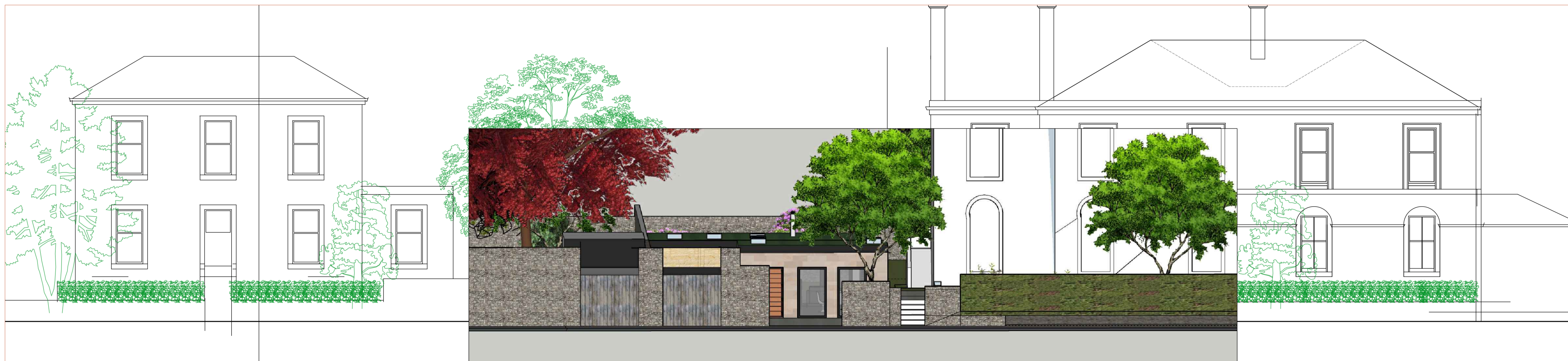
front elevation south west 1 : 1 0 0