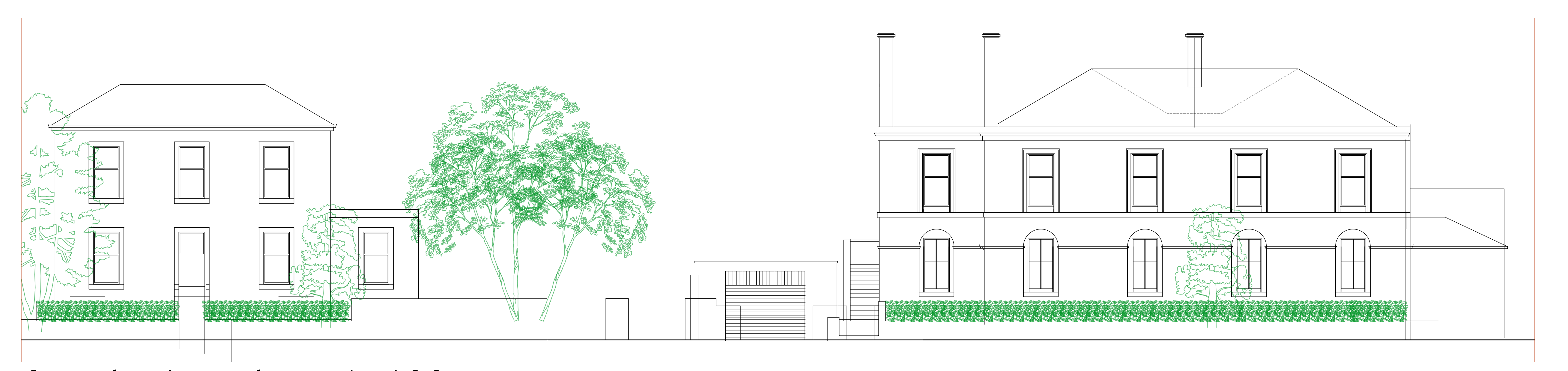
front elevation south west 1:100