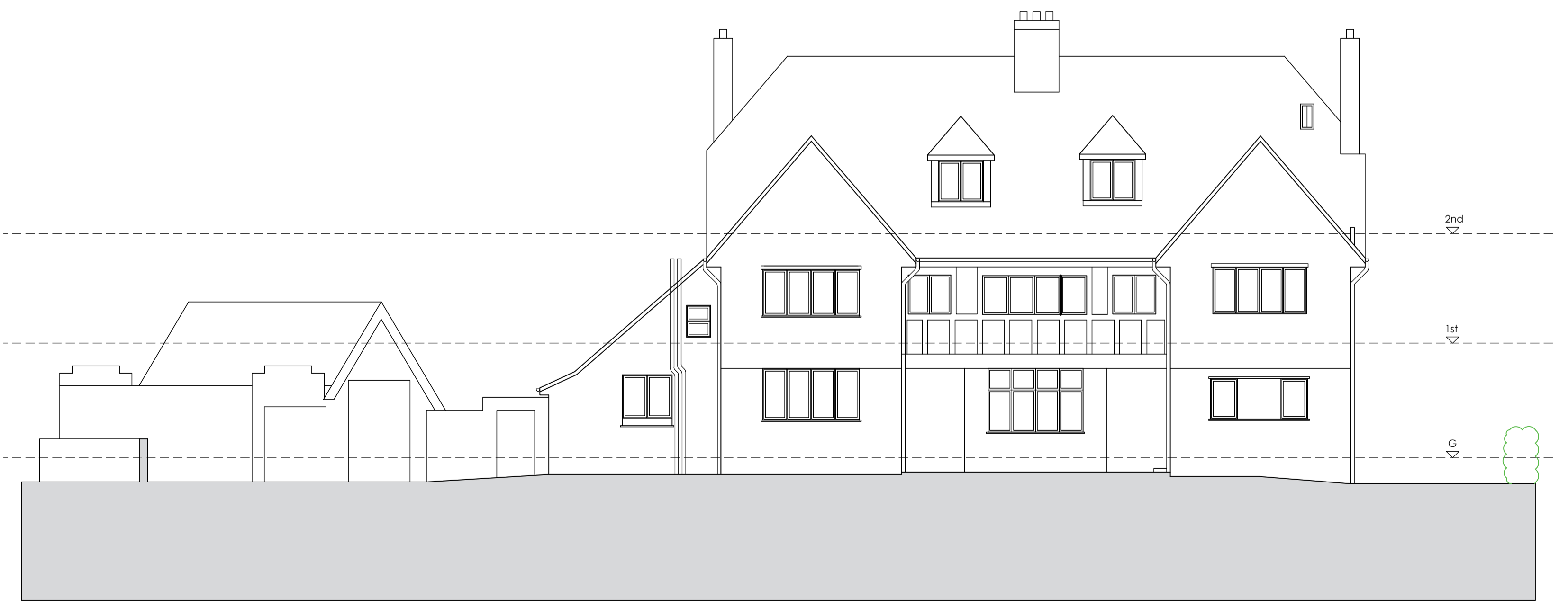
NORTH ELEVATION SCALE 1:100@A1 0 0.5 1.0 2.0 3.0 4.0 5.0m