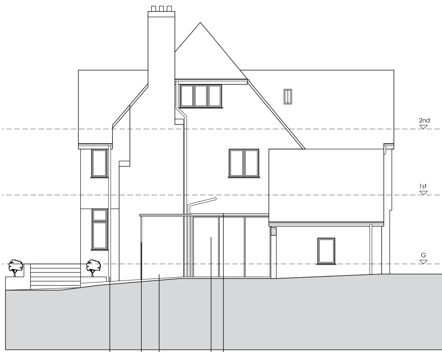
EAST ELEVATION SCALE 1:100@A1 0 0.5 1.0 2.0 3.0 4.0 5.0m