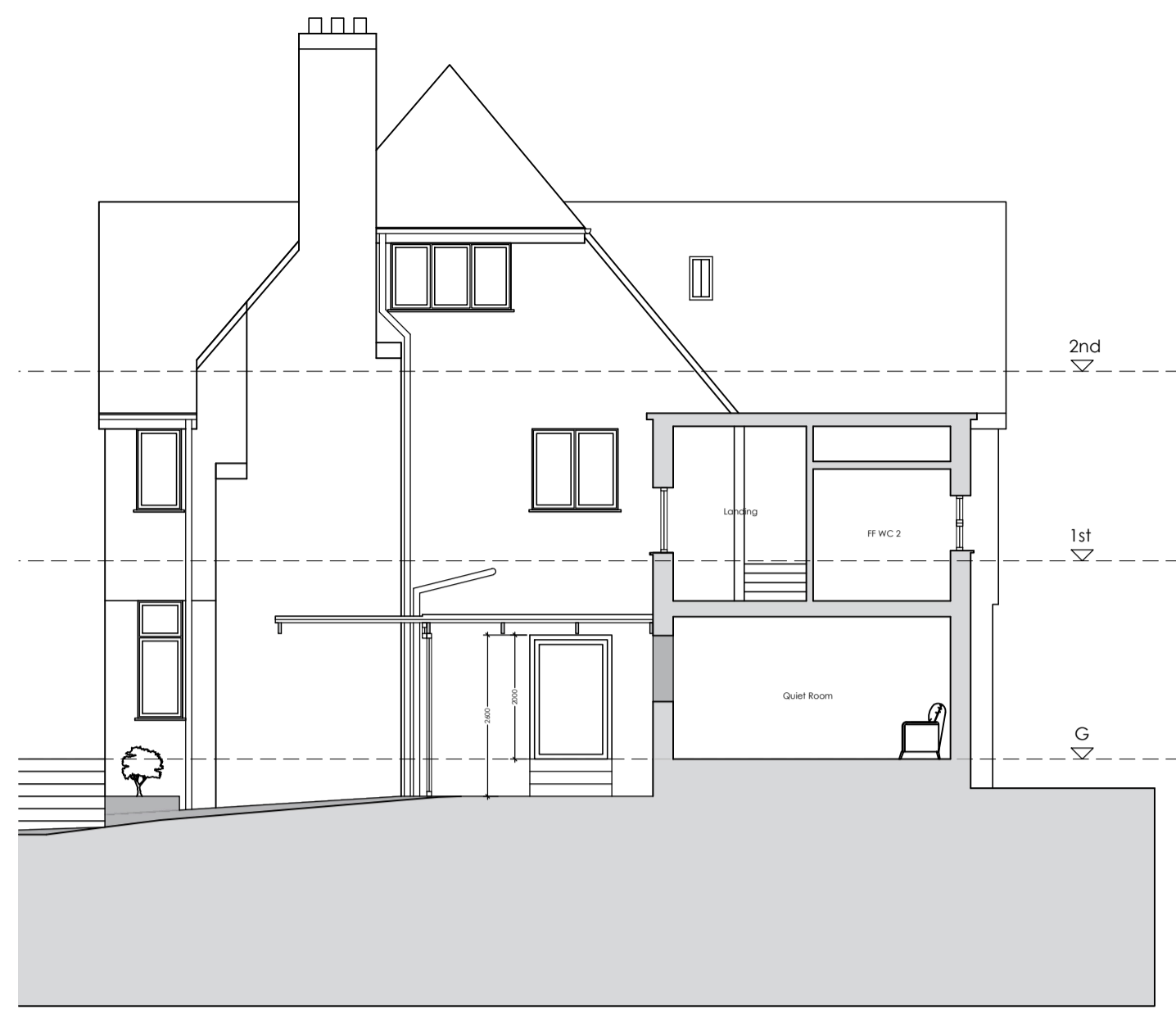
SECTION B SCALE 1:100@A1 0 0.5 1.0 2.0 3.0 4.0 5.0m