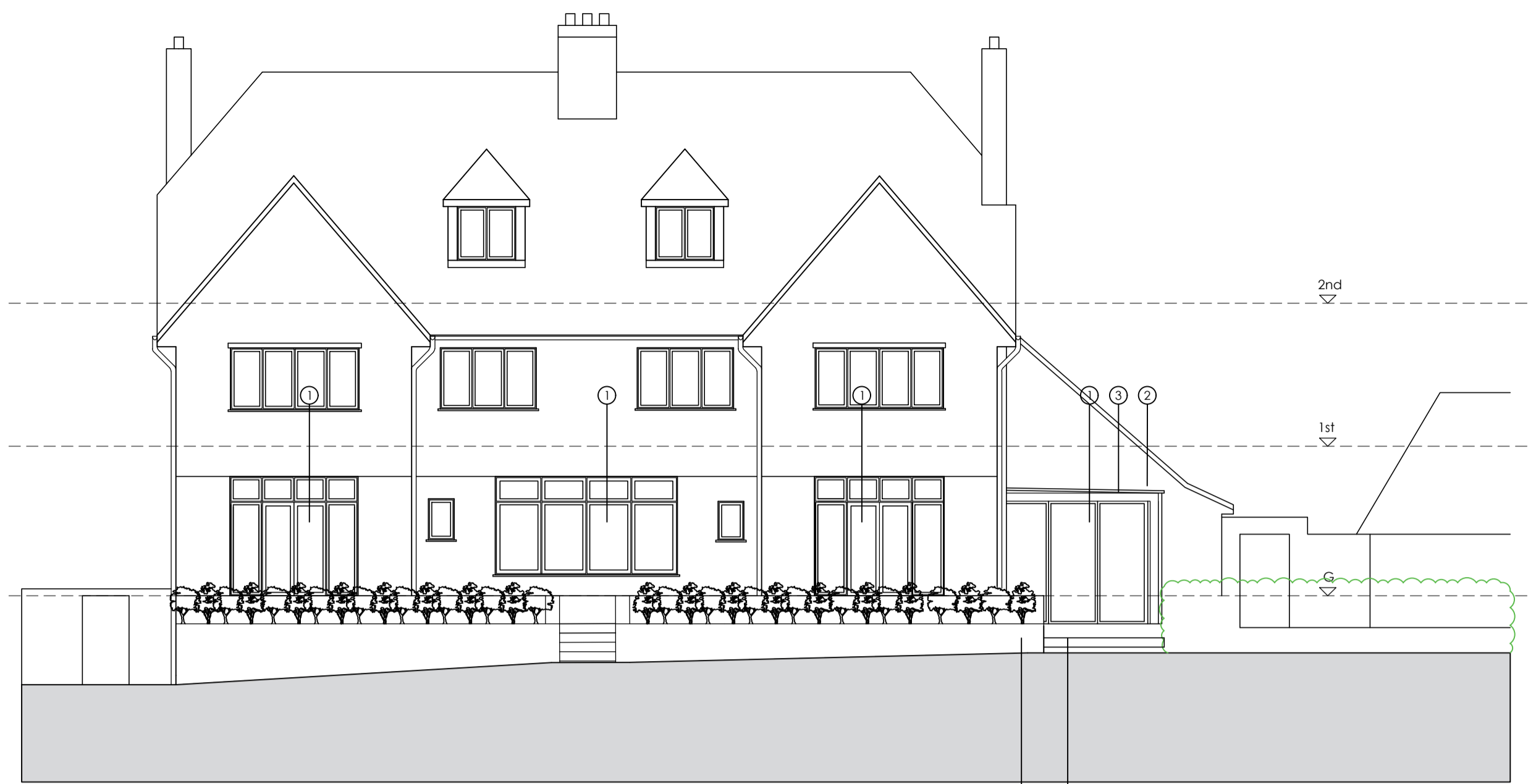
SOUTH ELEVATION SCALE 1:100@A1 0 0.5 1.0 2.0 3.0 4.0 5.0m