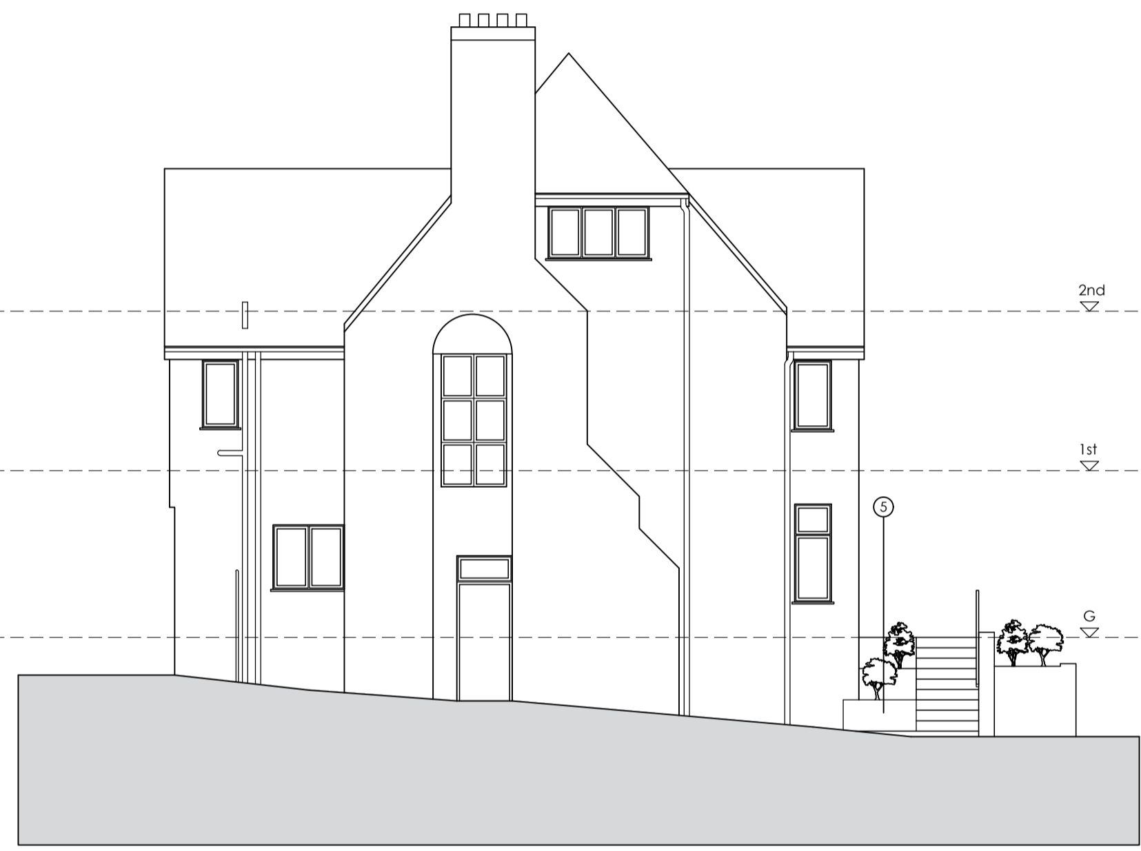
WEST ELEVATION SCALE 1:100@A1 0 0.5 1.0 2.0 3.0 4.0 5.0m