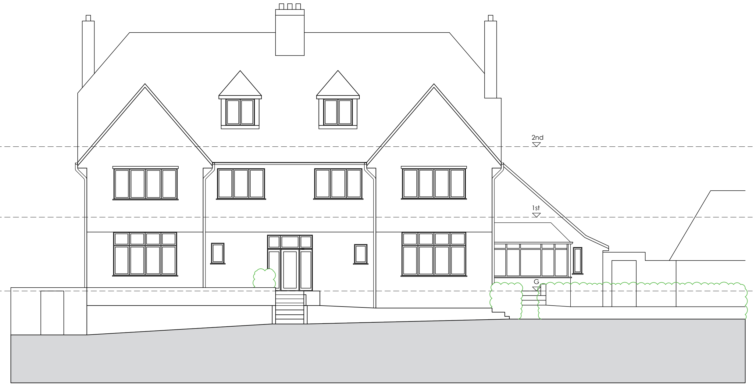
SOUTH ELEVATION SCALE 1:100@A1