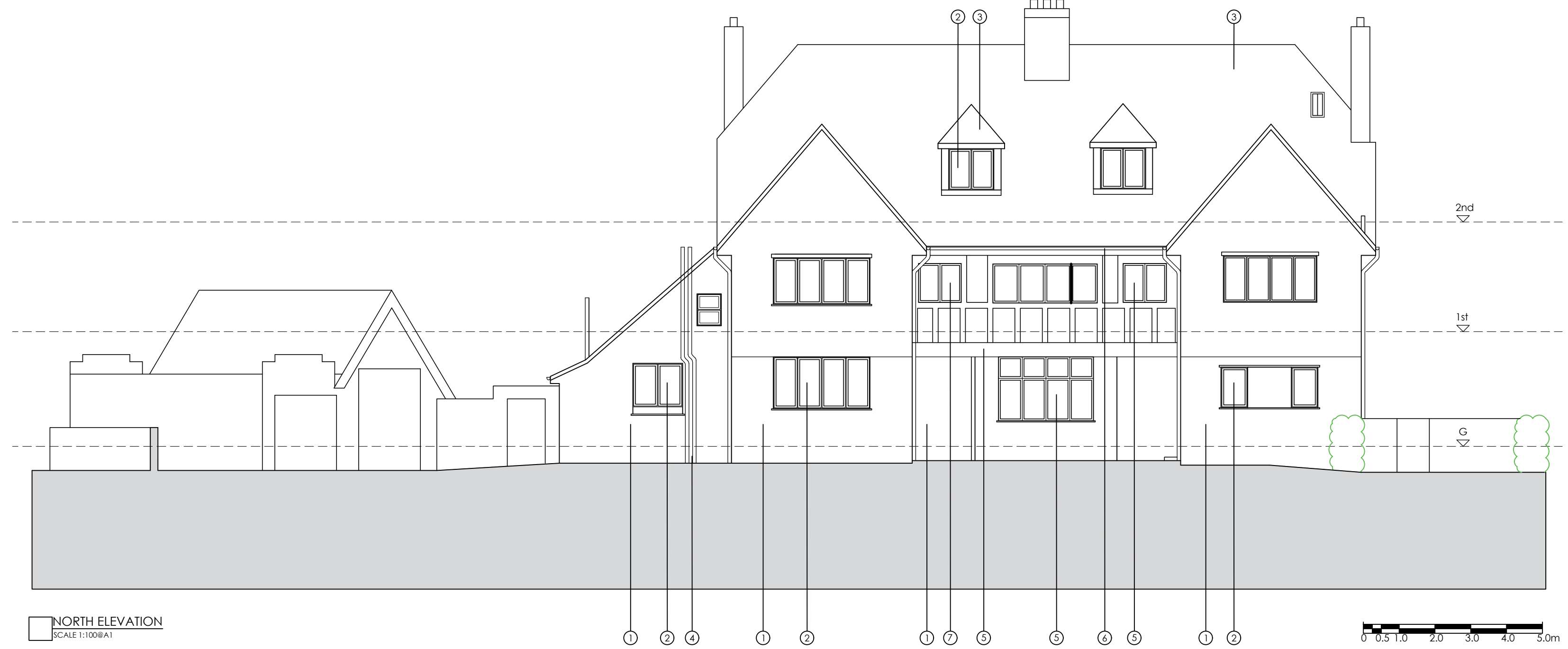
NORTH ELEVATION SCALE 1:100@A1