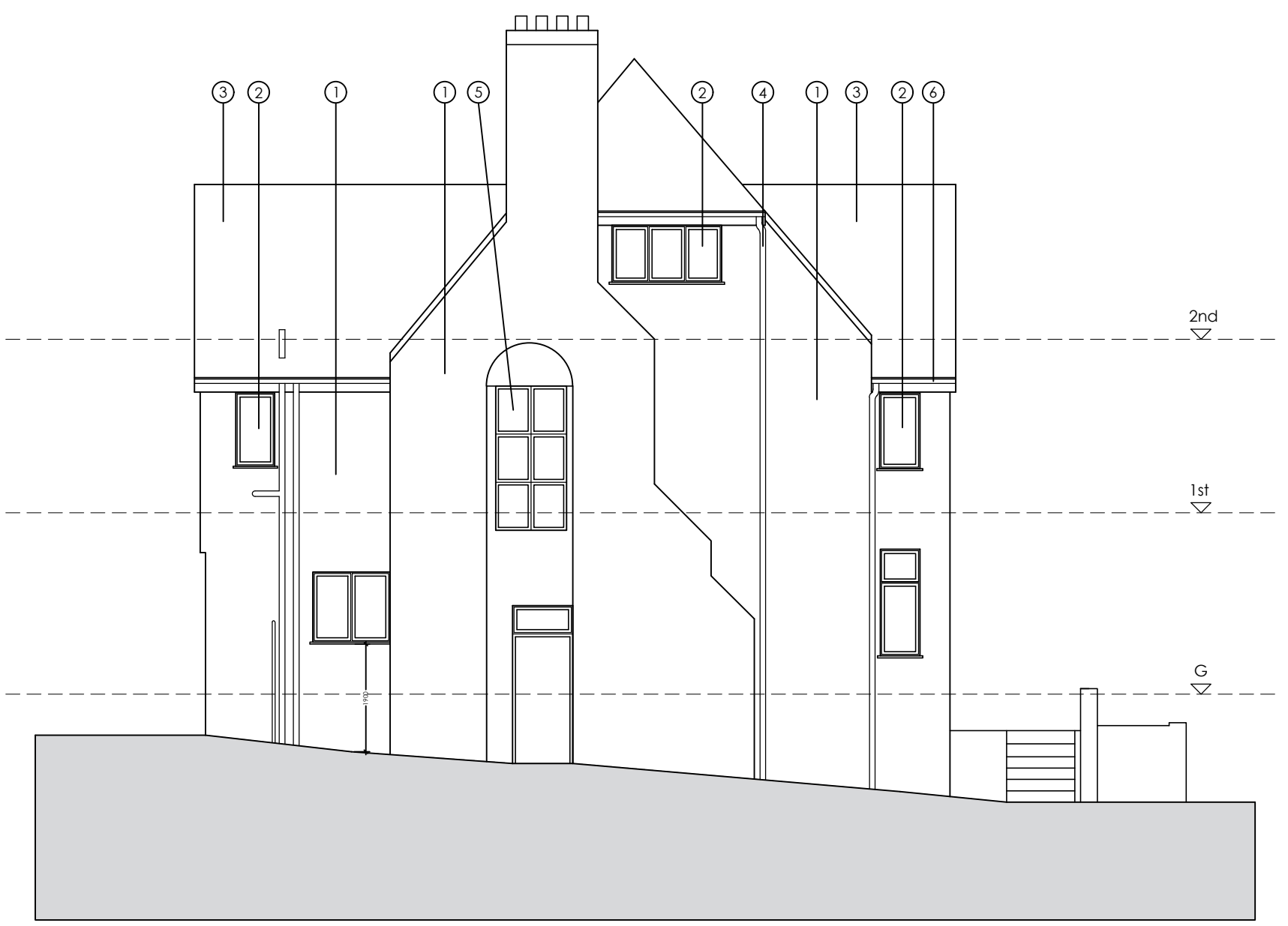
WEST ELEVATION SCALE 1:100@A1