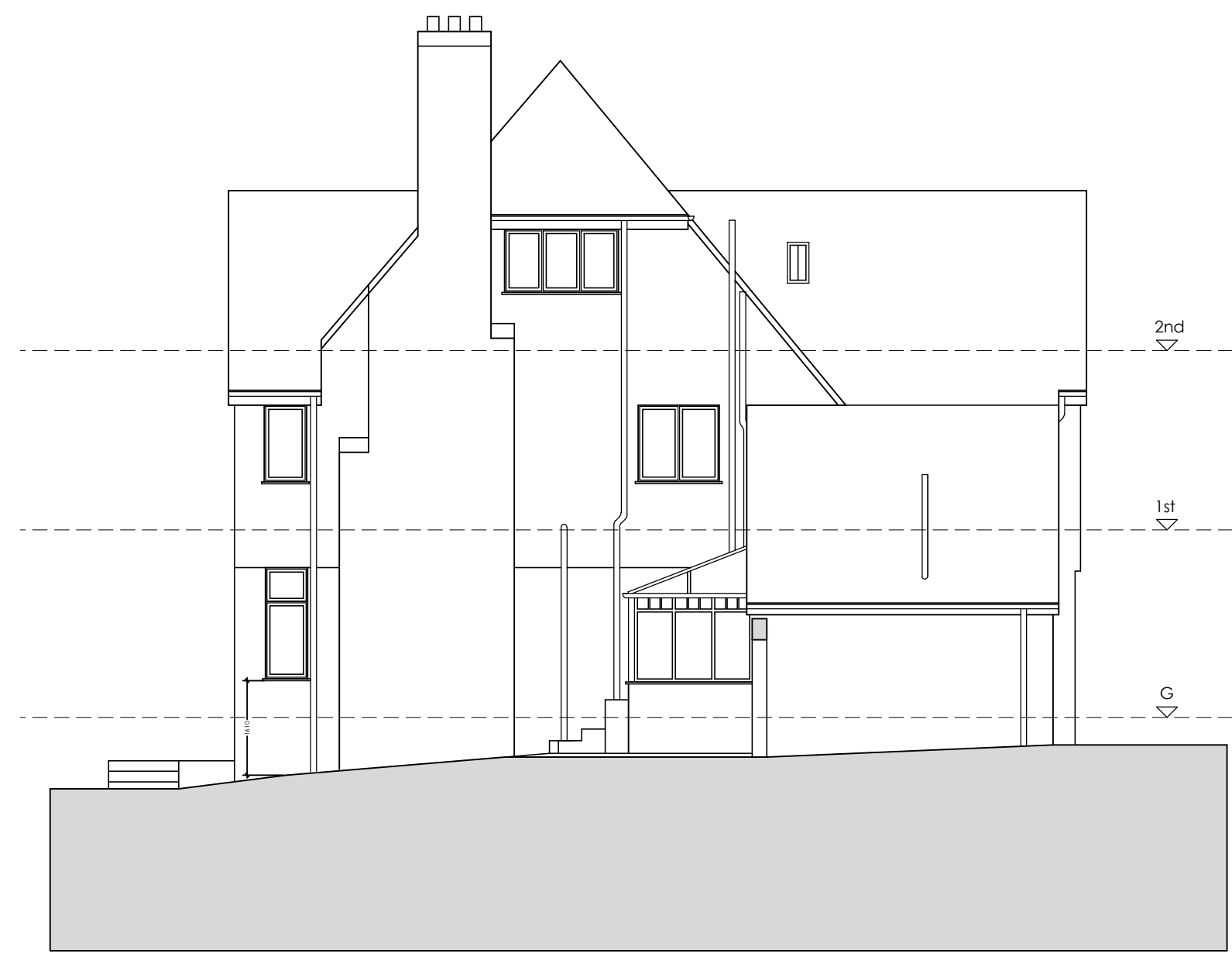
EAST ELEVATION SCALE 1:100@A1