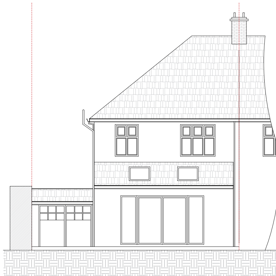
Existing Rear Elevation Scale 1:100