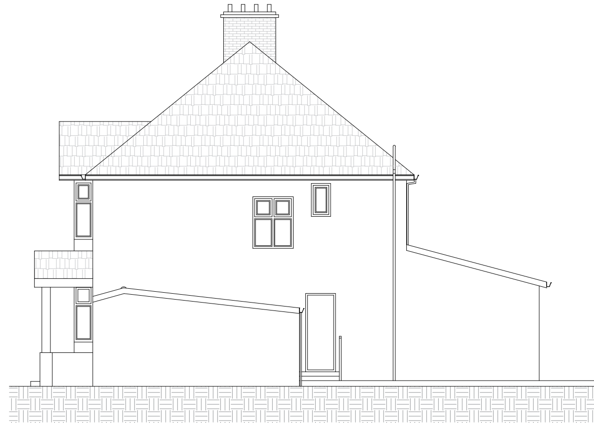
Existing Side Elevation ( From No . 173 ) Scale 1:100