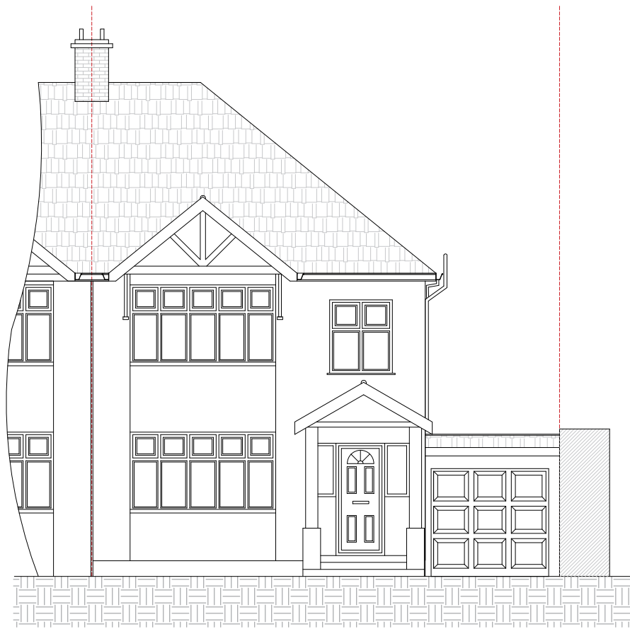
Existing Front Elevation Scale 1:100