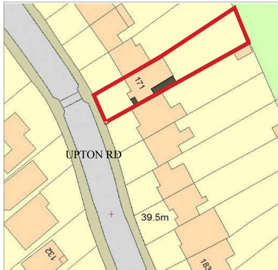
Proposed block plan