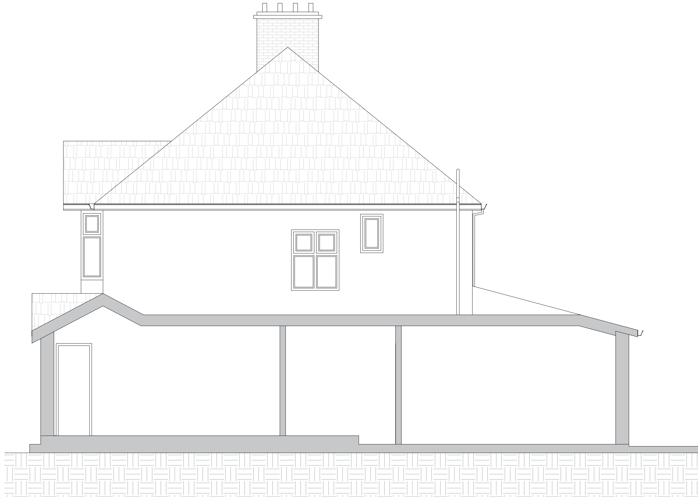
Proposed Section AA Scale 1:50