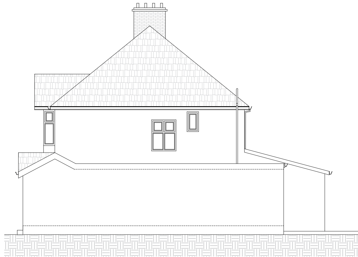
Proposed Side Elevation ( From No . 173 ) Scale 1:100