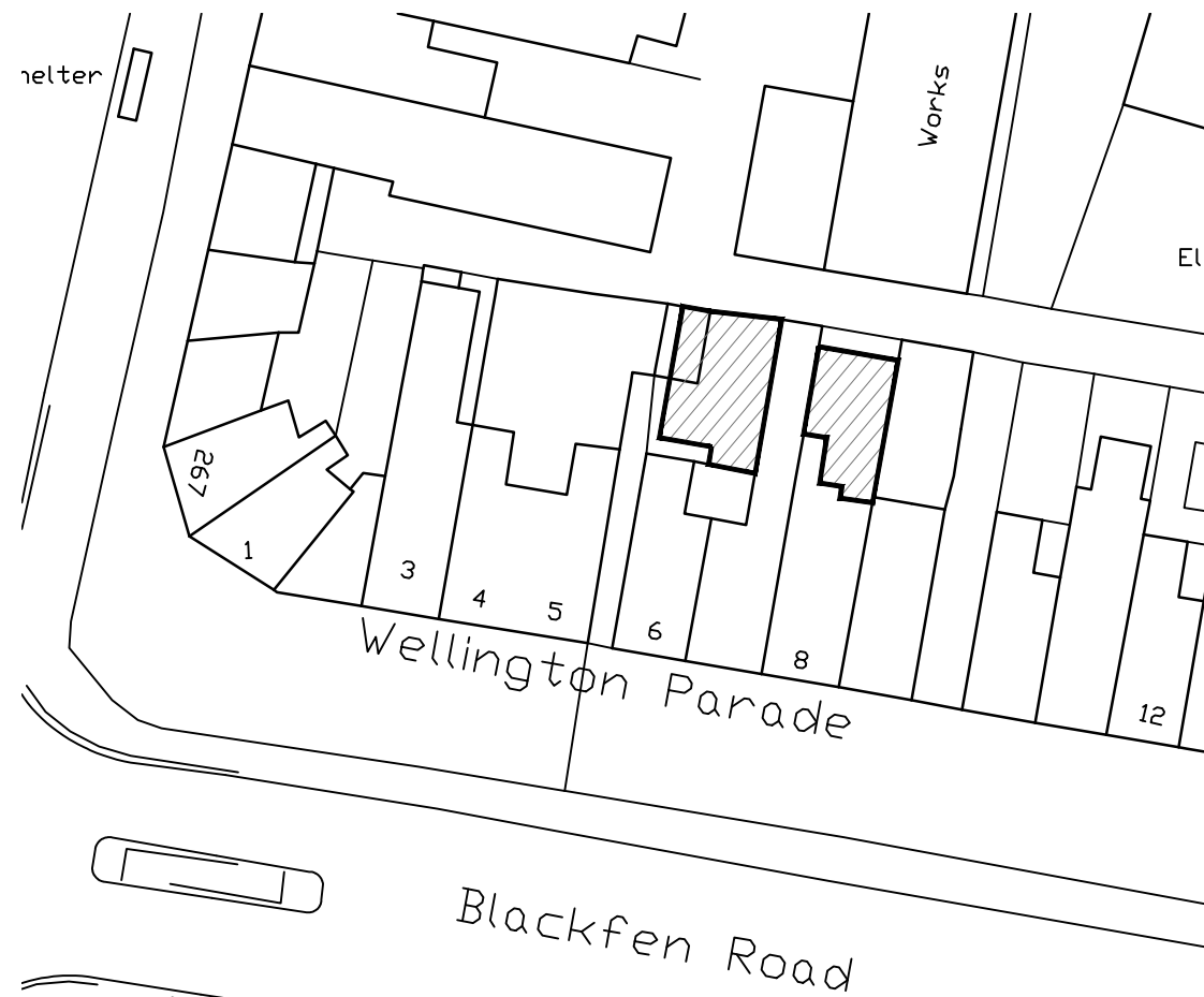
Block Plan @ 1:500 0 10 25m Scale 1:500