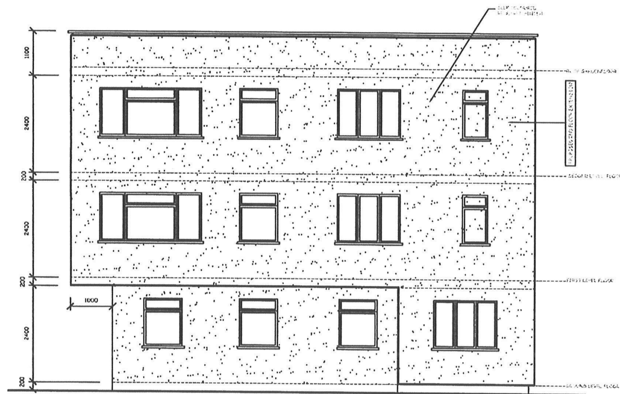
PRE - EXISTING REAR ELEVATION (C) (SCALE 1:50)