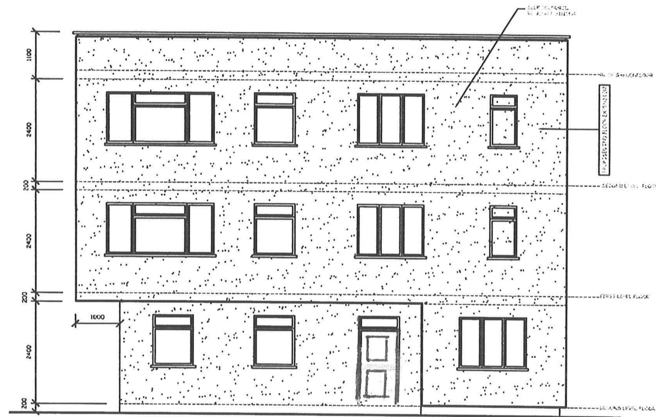
EXISTING-REAR ELEVATION (C) (SCALE 1:50)