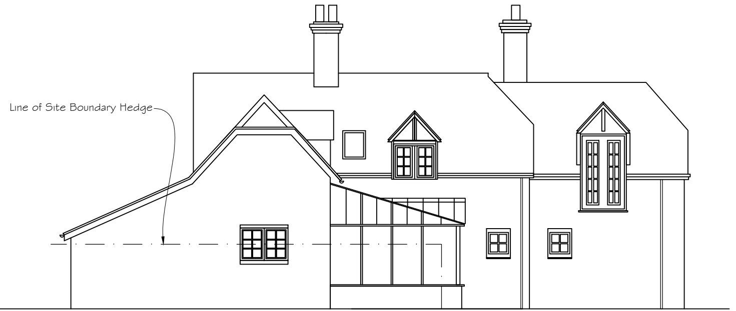
2 Existing South-East Elevation 1 : 100