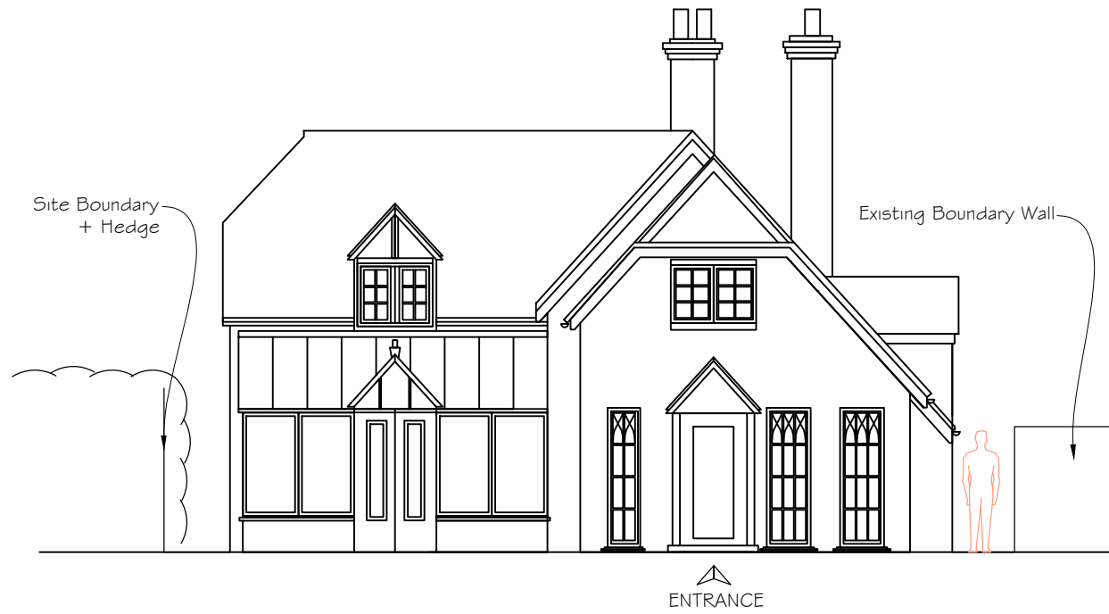
1 Existing North-East Elevation 1 : 100