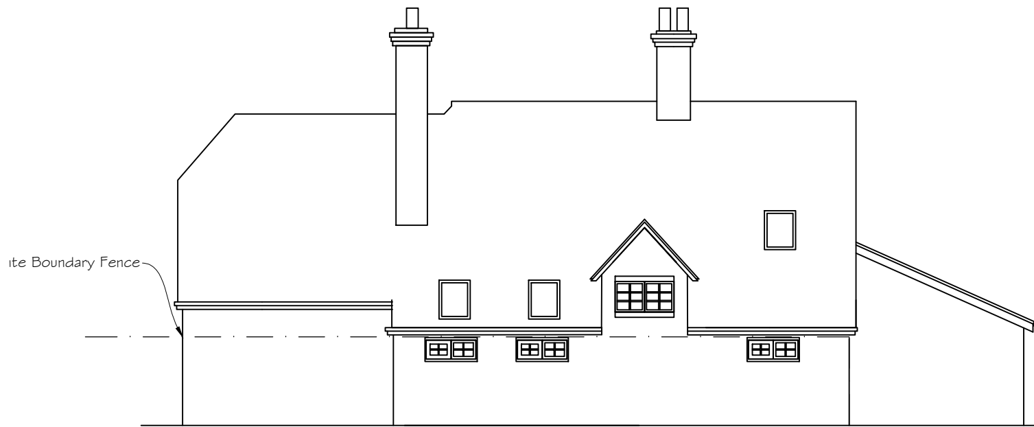
3 Existing North-West Elevation 1 : 100