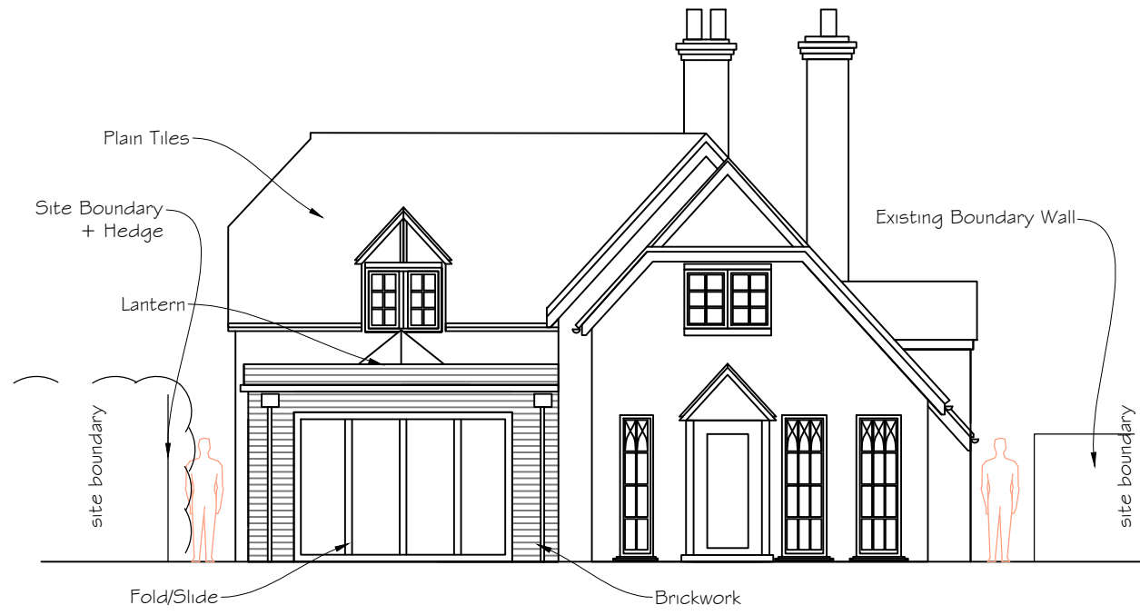
1 Proposed North-East Elevation 1 : 100