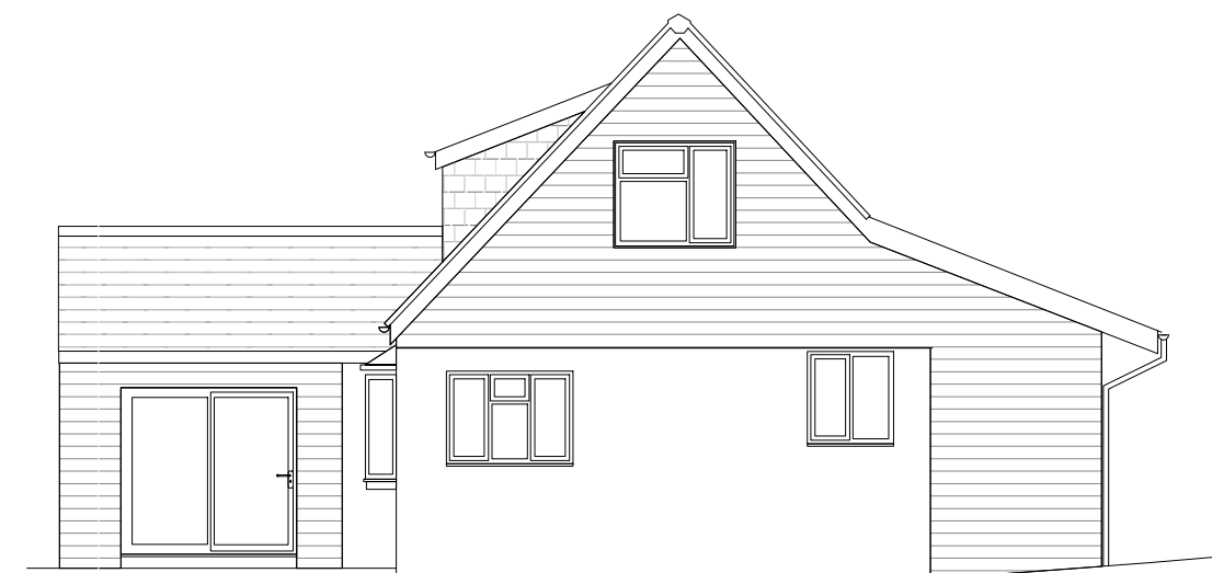
4.SIDE ELEVATION (1:100 SCALE) North East