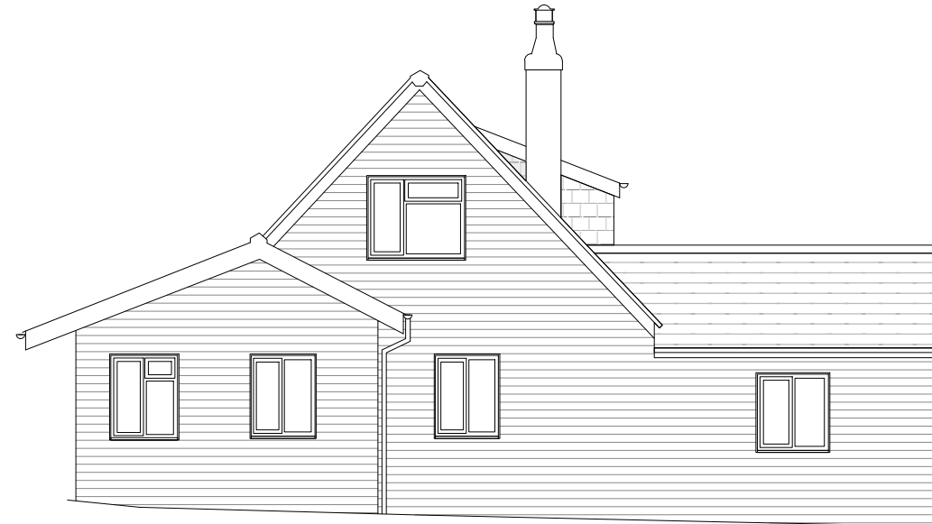
2. SIDE ELEVATION (1:100 SCALE) South West