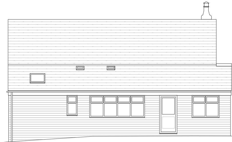
1.FRONT ELEVATION (1:100 SCALE) North West