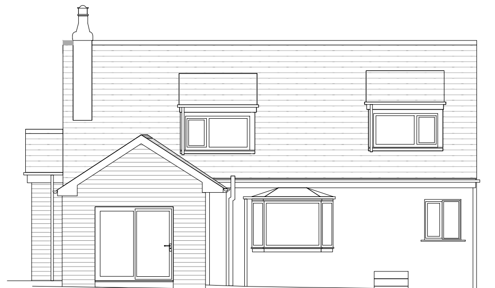
3. REAR ELEVATION (1:100 SCALE) South East