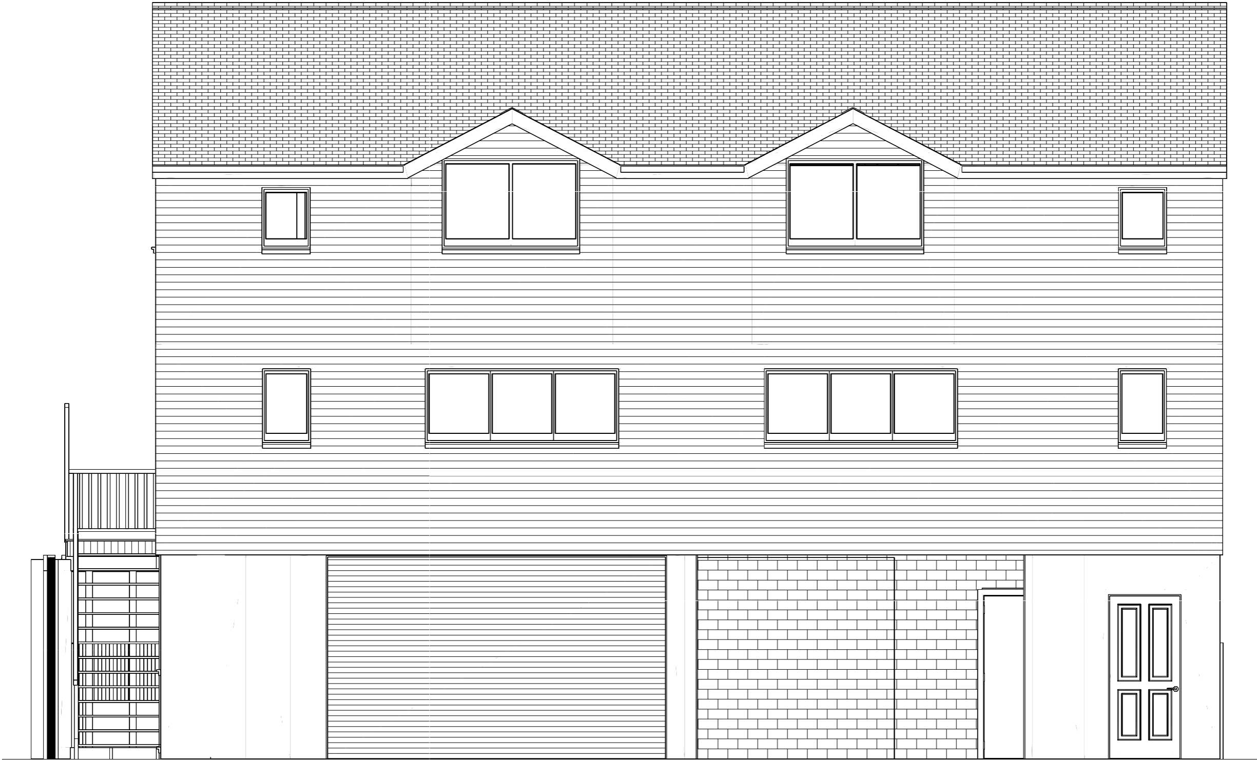
EL-04 Proposed North Elevation as per PA21-04432