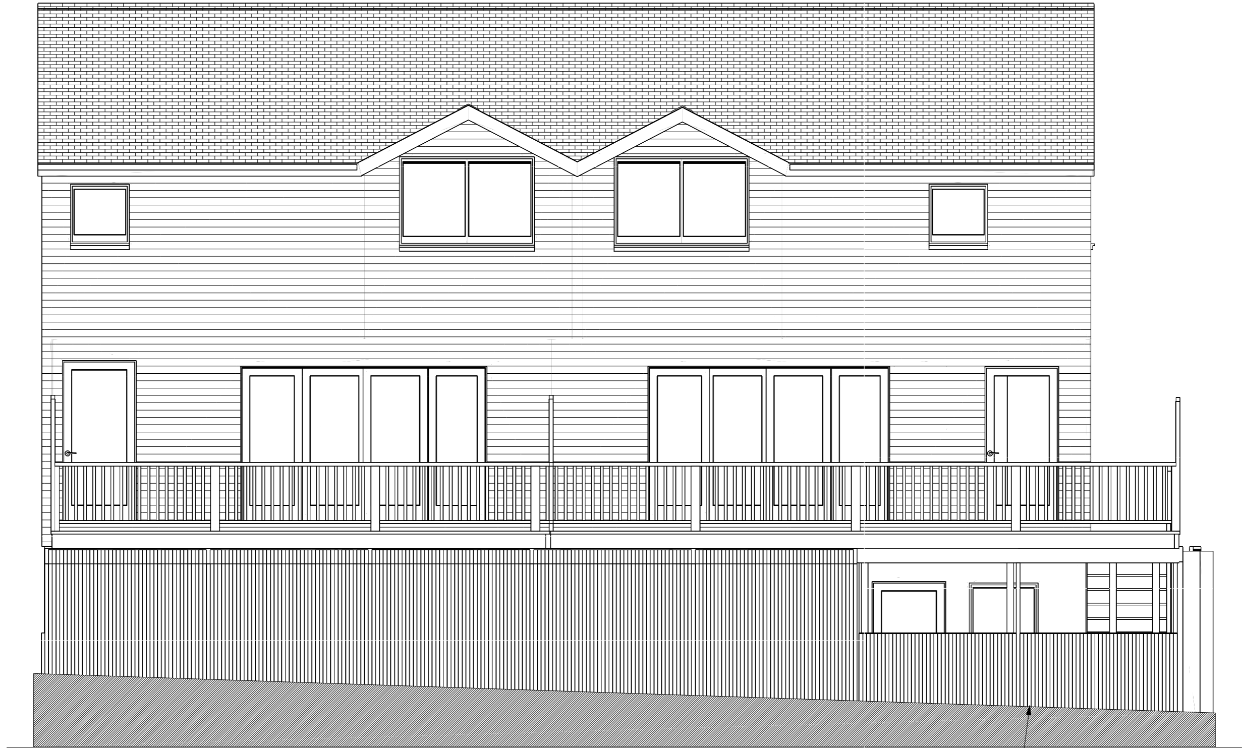
EL-05 Proposed South Elevation as per PA21-04432