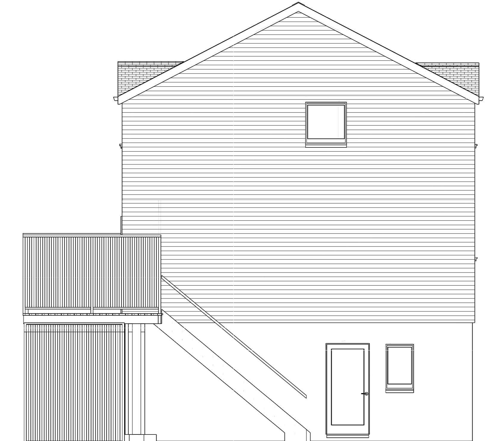
EL-06 Proposed East Elevation as per PA21-04432