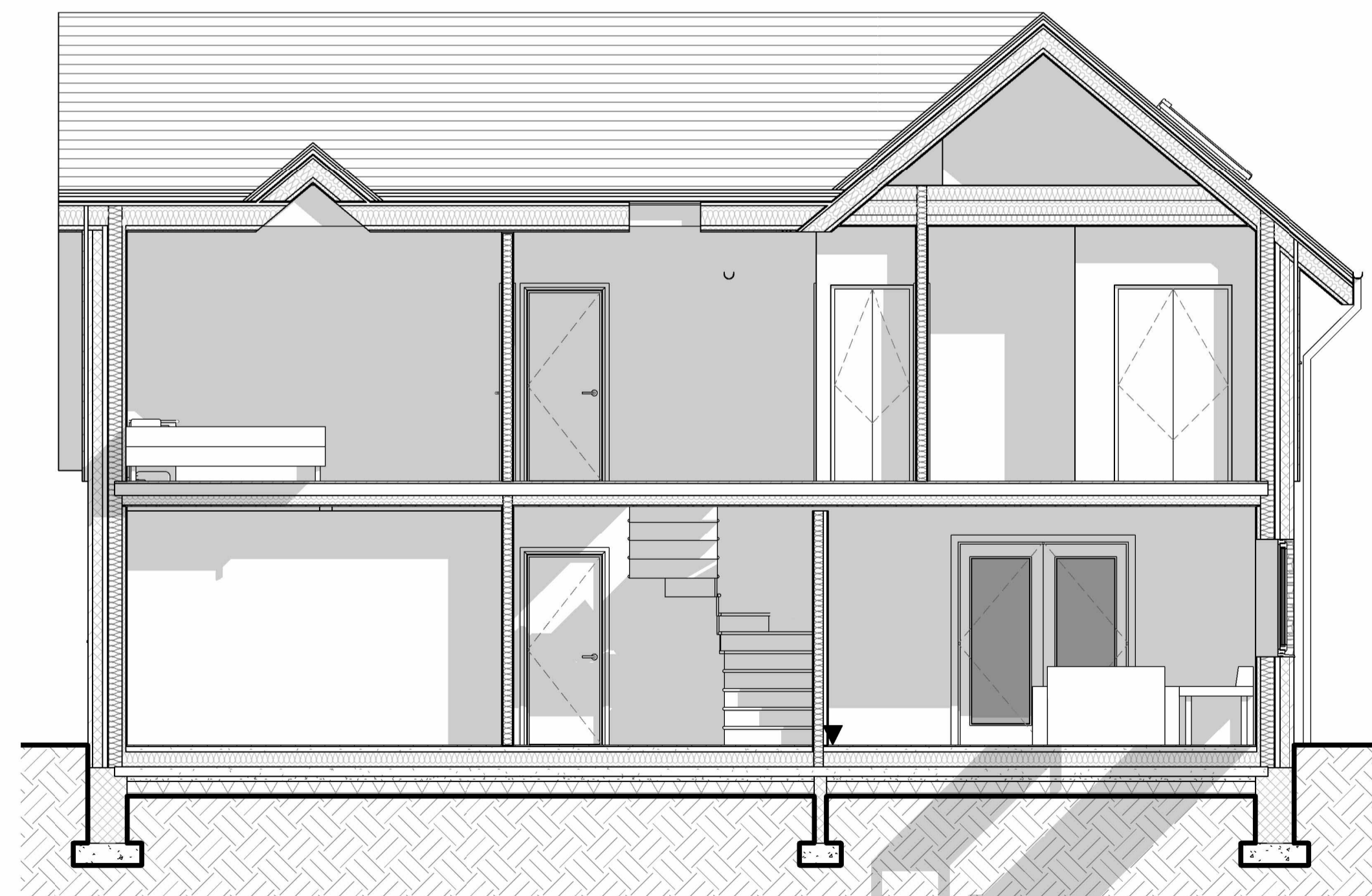
2 Site Section B 1 : 50

Cornwall Planning Group Head Office: Chi Gallos, Hayle Marine Renewables Business Park, North Quay, Hayle, Cornwall, TR27 4DD Phone: +44 (0)1736 448 500 Email: office@cornwallplanninggroup.co.uk Web: www.cornwallplanninggroup.co.uk