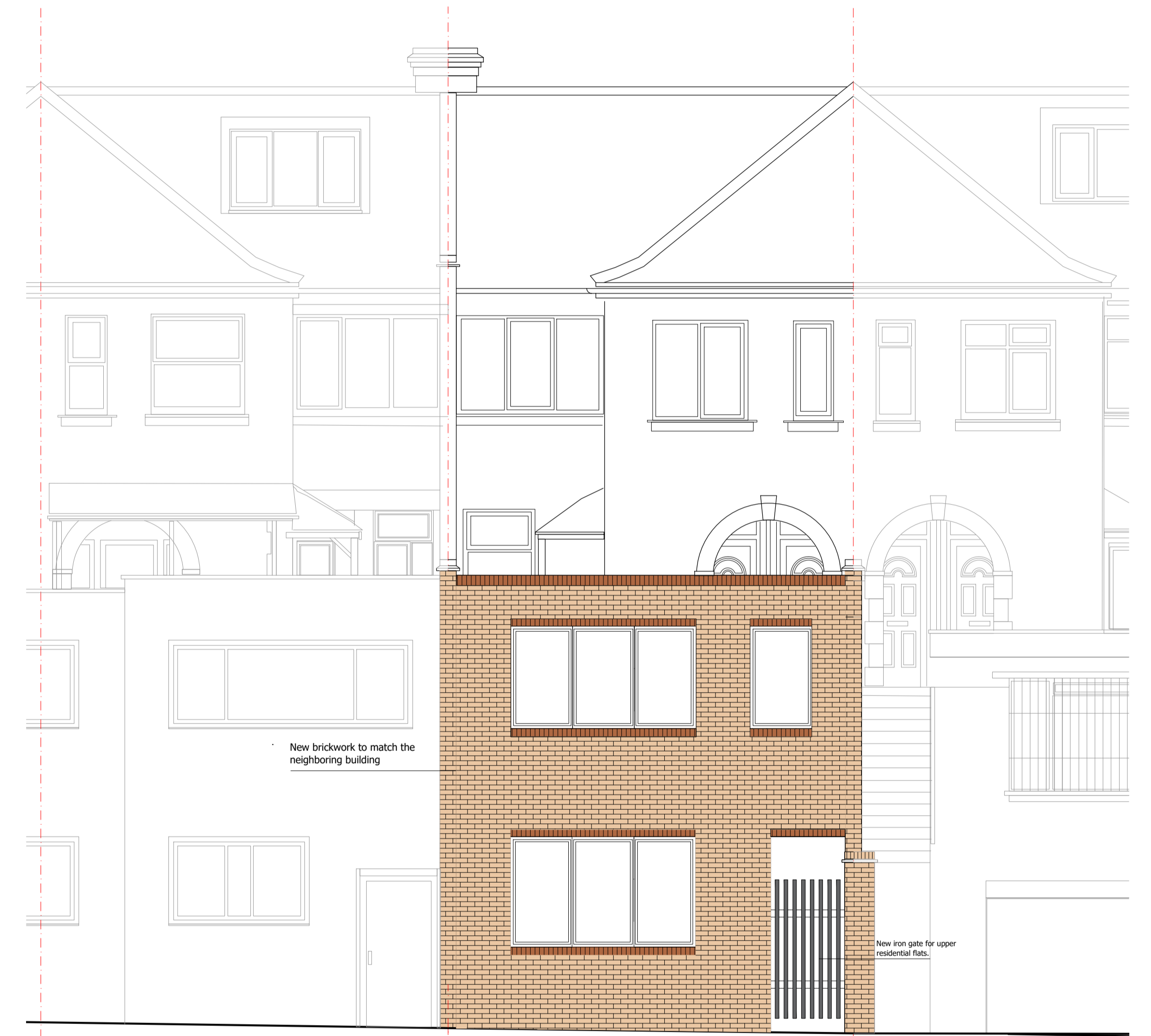
Rear Elevation 1051 Finchley Road.

Application Number: 22/0768/FUL 12 April 2022