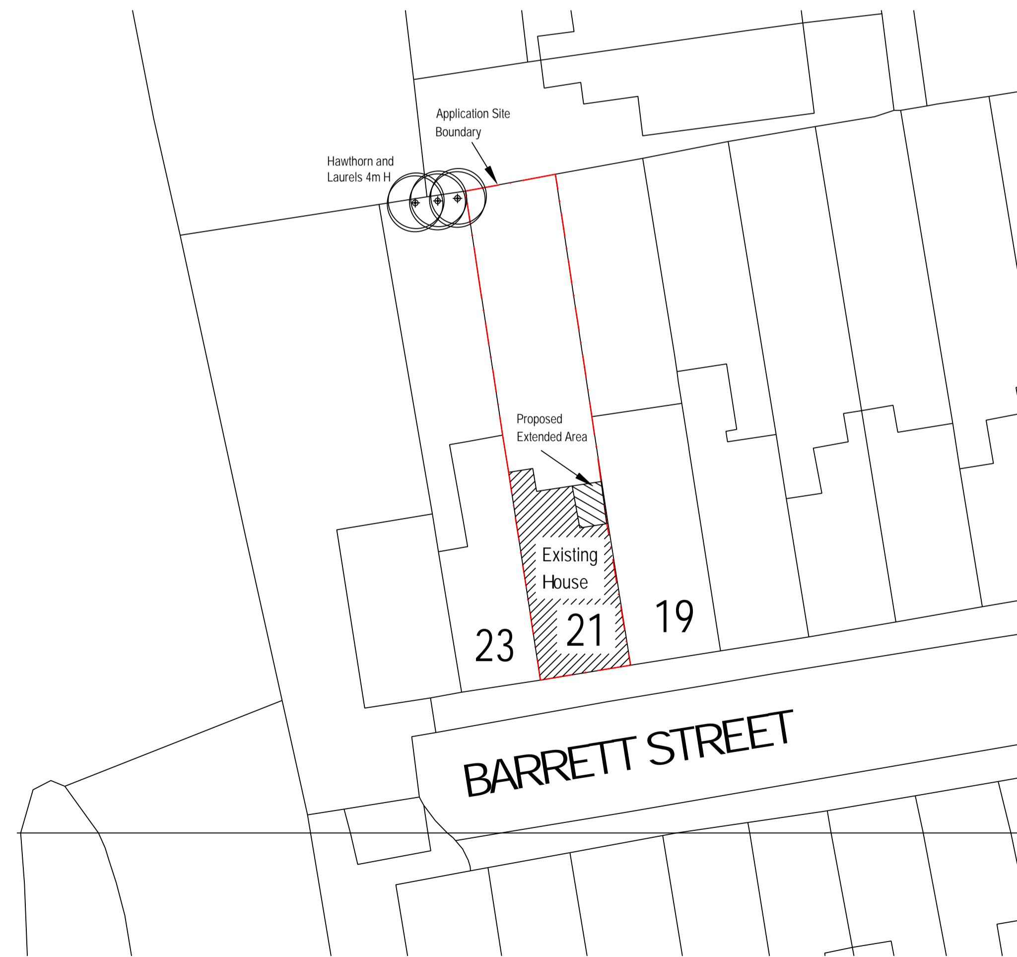
Block Plan As Proposed (1:200)