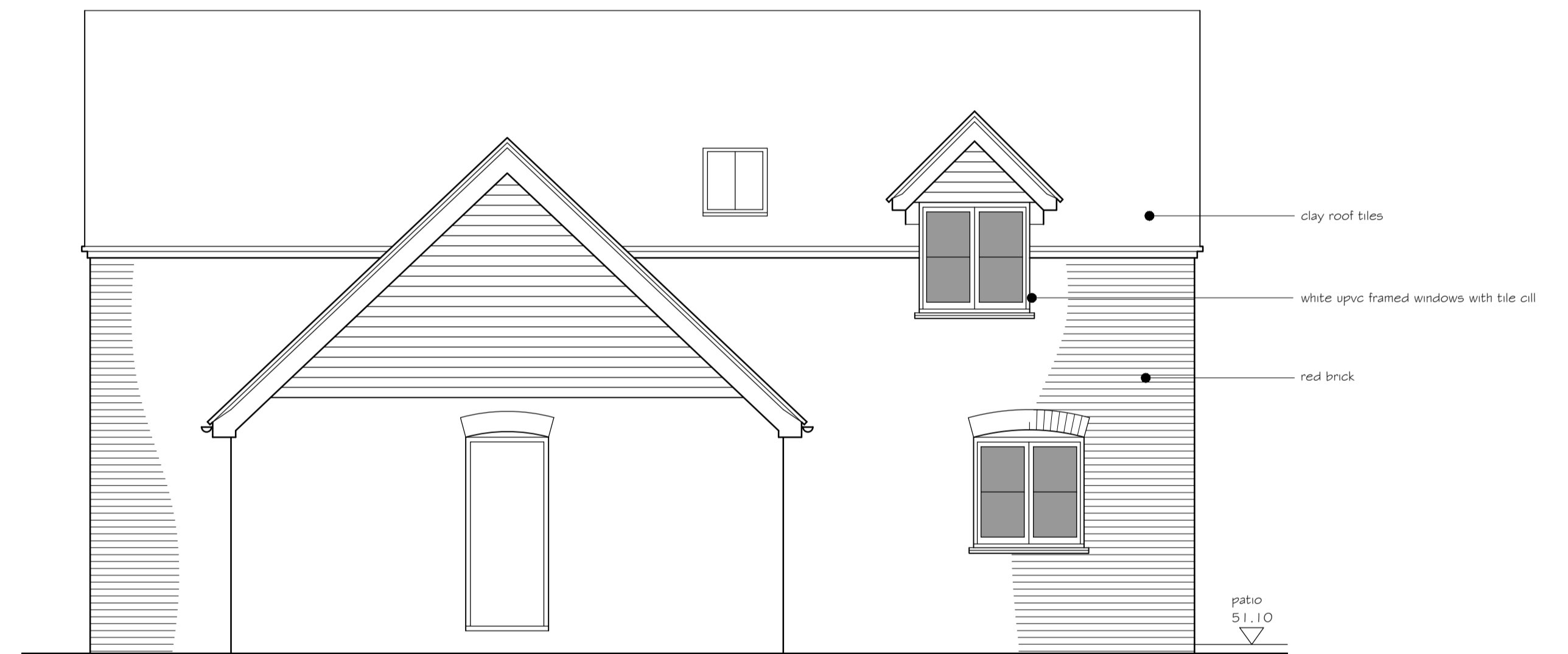
PROPOSED SIDE ELEVATION (west)