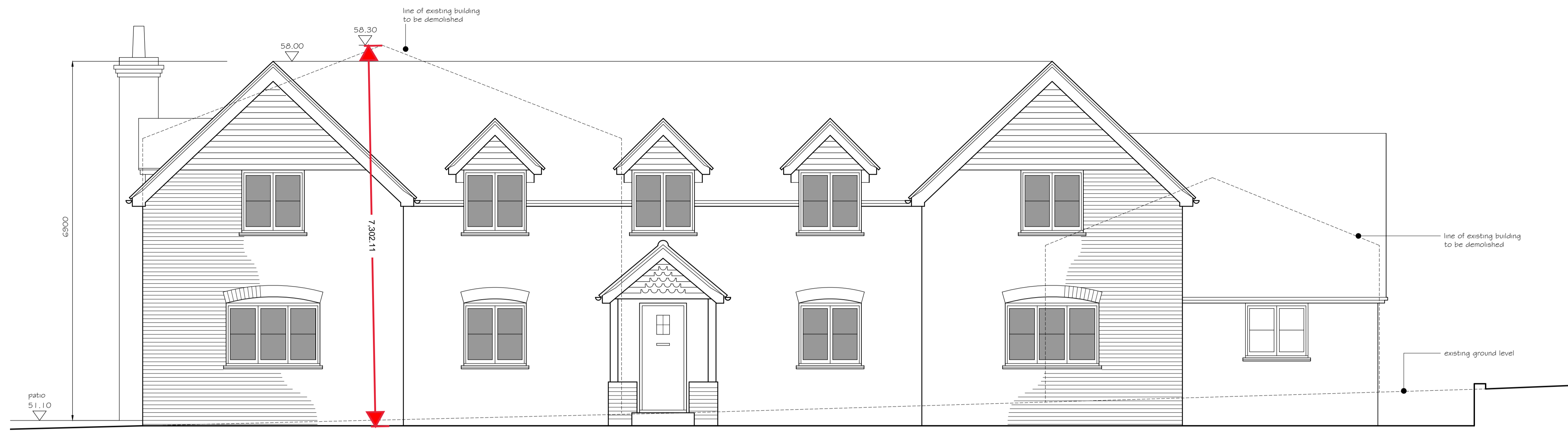
PROPOSED FRONT ELEVATION (north)