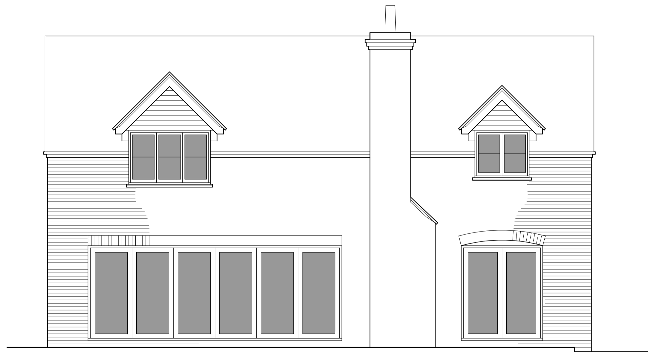
PROPOSED SIDE ELEVATION (east)