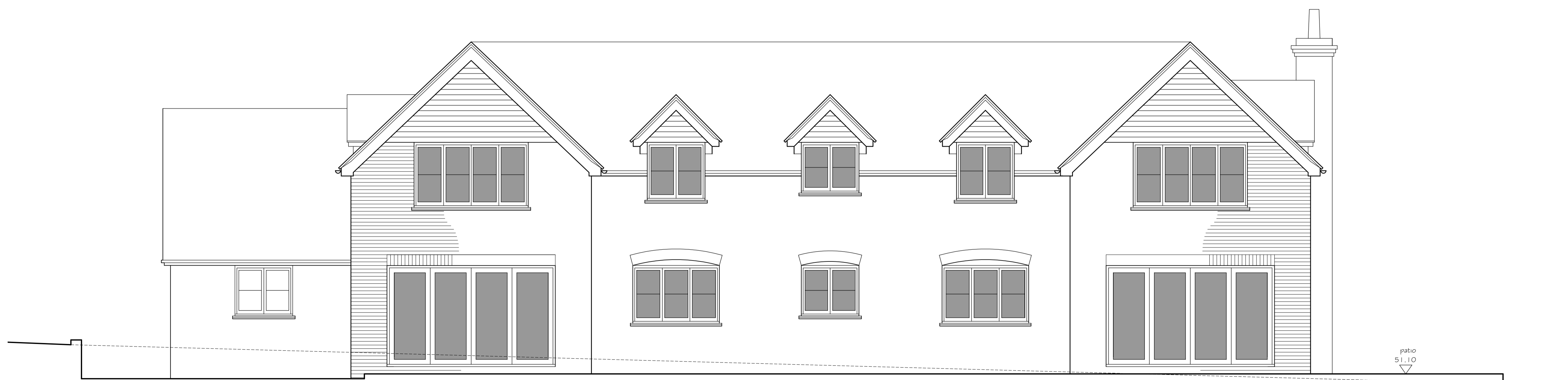
PROPOSED REAR ELEVATION (south)