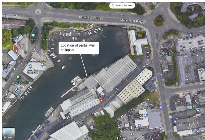
Figure 1: Location Plan 1

The section of partially collapsed wall is situated in the Port of Plymouth, as indicated on Figure 1.